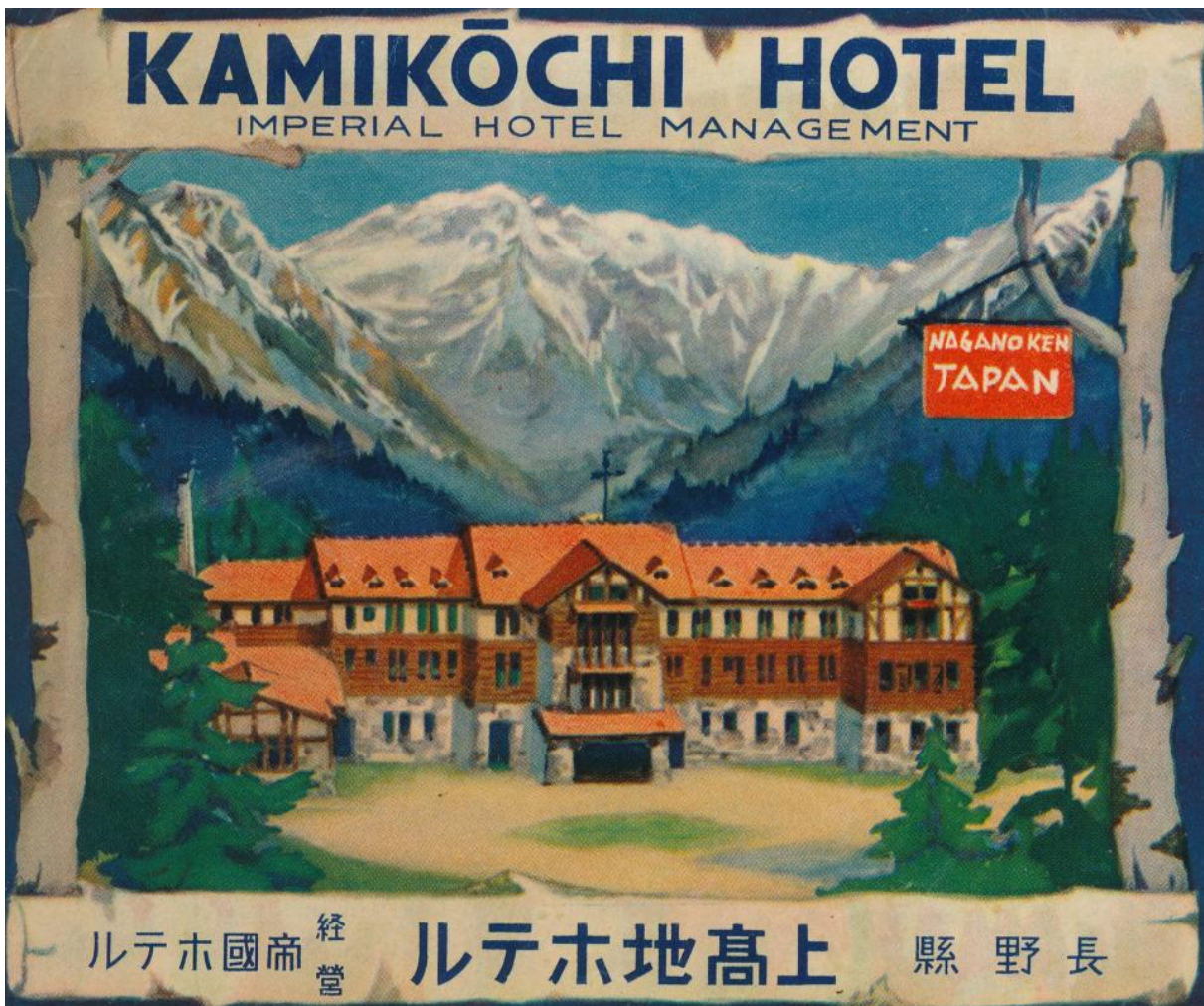
The Imperial Kamikochi Hotel, completed in 1933 with the help of funding from the Ministry of Finance