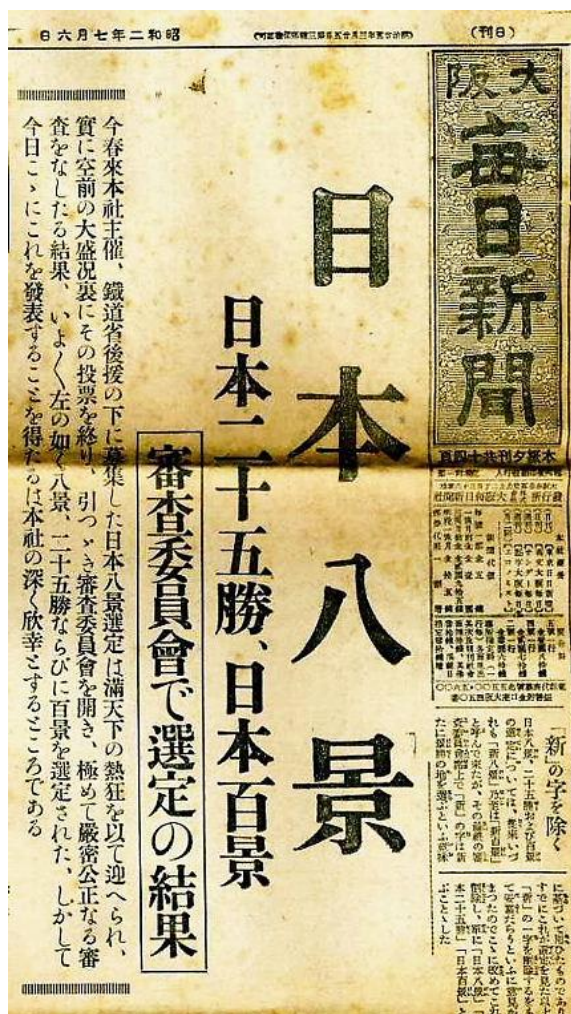
Newspaper clippings from 1927 record Kamikōchi's triumph in the "valley" category

Osaka Mainichi Shinbun "Nihon Hakkei" (6 July 1927), p.1.