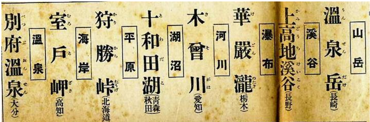
Newspaper clippings from 1927 record Kamikochi's triumph in the "valley" category

Osaka Mainichi Shinbun "Nihon Hakkei" (6 July 1927), p.1.