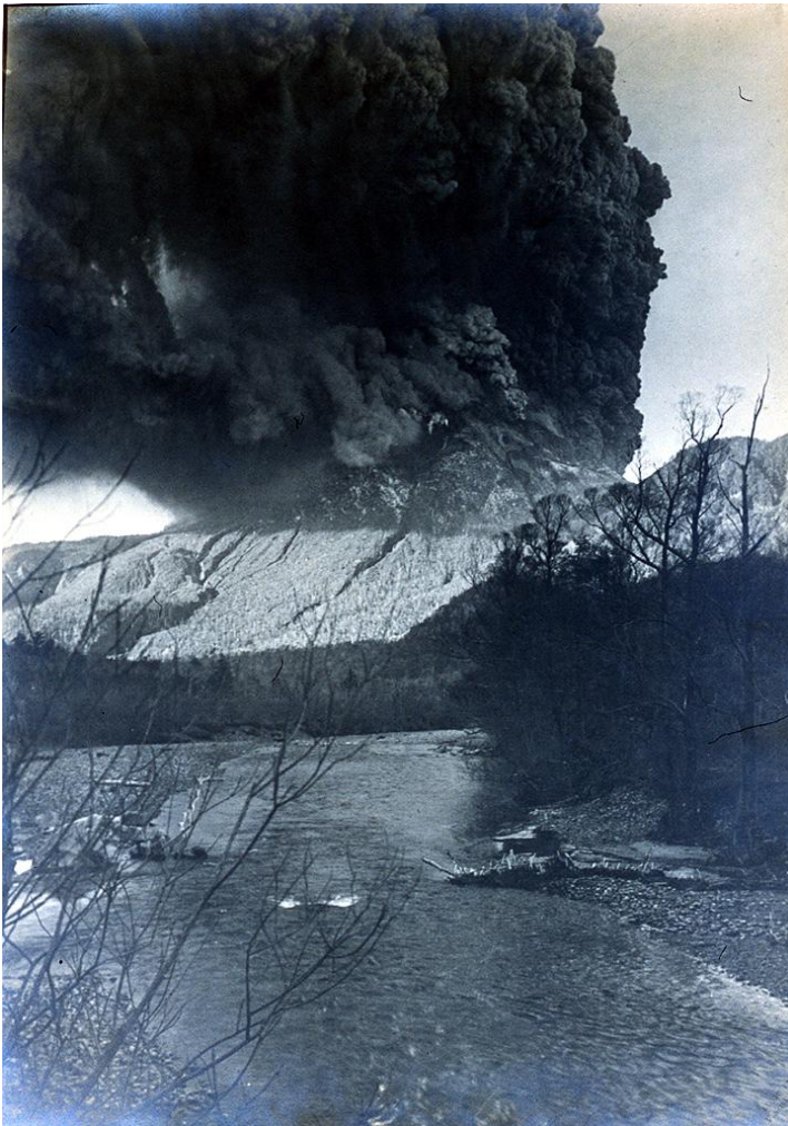
An eruption of Mount Yake