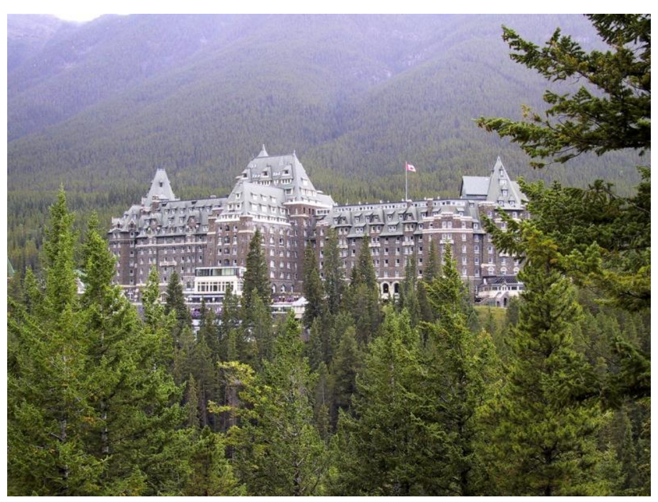
The Banff Springs Hotel today