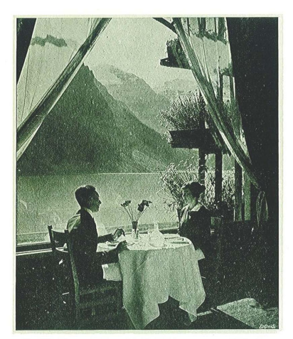
The Dining Room at the Chateau Lake Louise looks out upon one of the loveliest views in the world