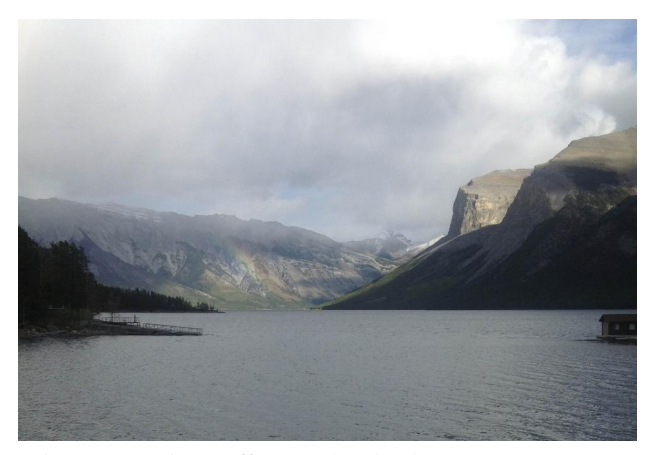
Lake Minnewanka, Banff National Park, Alberta, 2012

This work is licensed under a Creative Commons Attribution 2.0 Generic License.