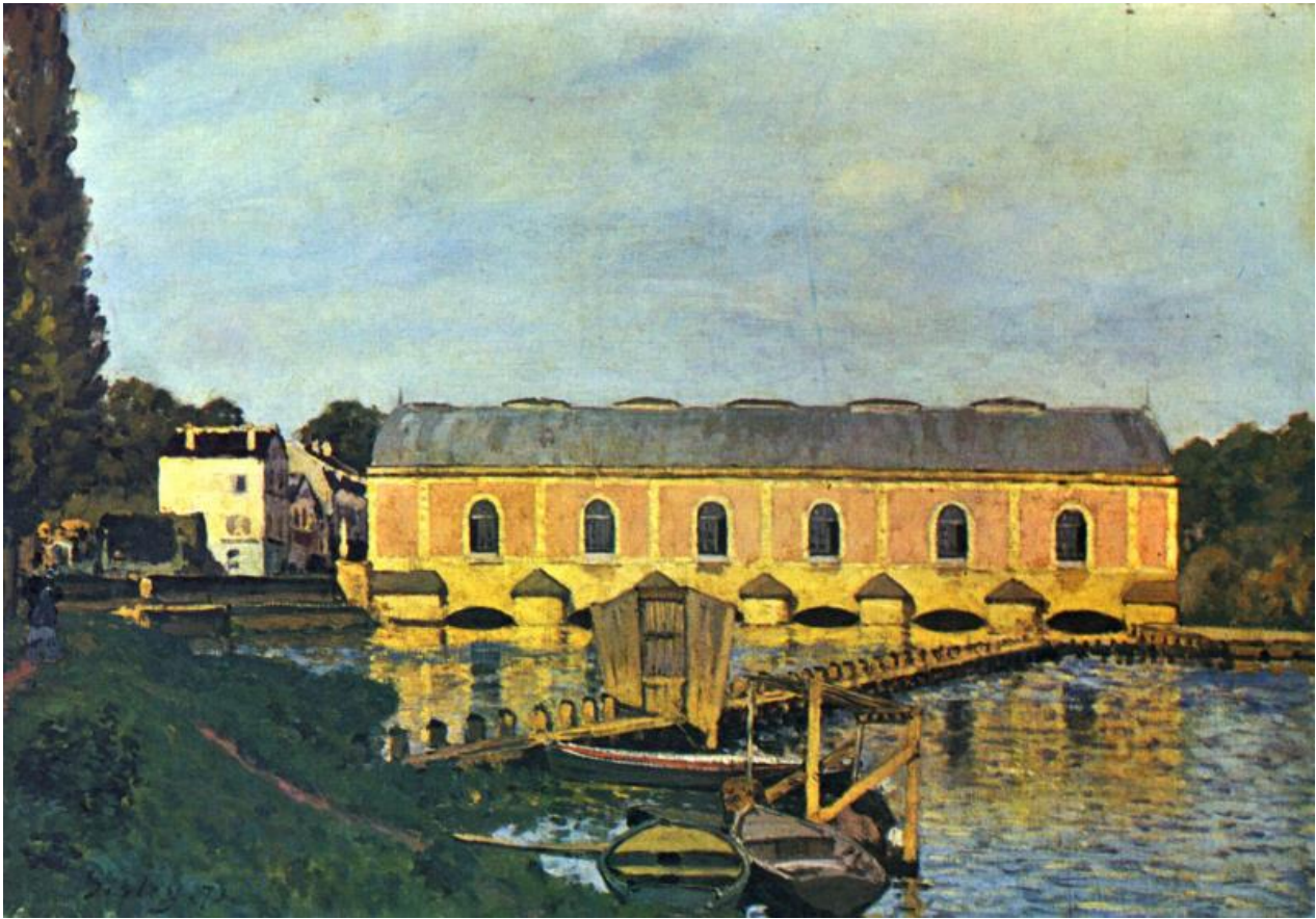
The 1859 Machine de Marly painted by Alfred Sisley in 1873

Painting by Alfred Sisley in 1873. The title in French: La Machine de Marly.