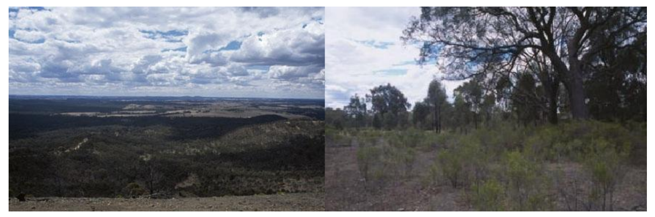
These two images show: After an extensive restoration program in the 1970s and 1980s, and continued environmental monitoring, the Puckapunyal site was entered into the Australian Commonwealth Heritage List in 2004

The evolution of land management at Puckapunyal (and broader Defence environmental initiatives that came after the project) from the 1970s until the present is an obvious example of military environmentalism in an Australian context. The incorporation into defense policy of the notion of military training areas as de facto wildlife reserves is a key feature of so-called "khaki conservation," along with stringent environmental processes and controls, and greater focus on transparency and accountability in matters relating to the environmental impact of defense activity. "Swords to ploughshares" programs, in which disused military sites are turned over to conservation or agriculture, are also becoming more commonplace.