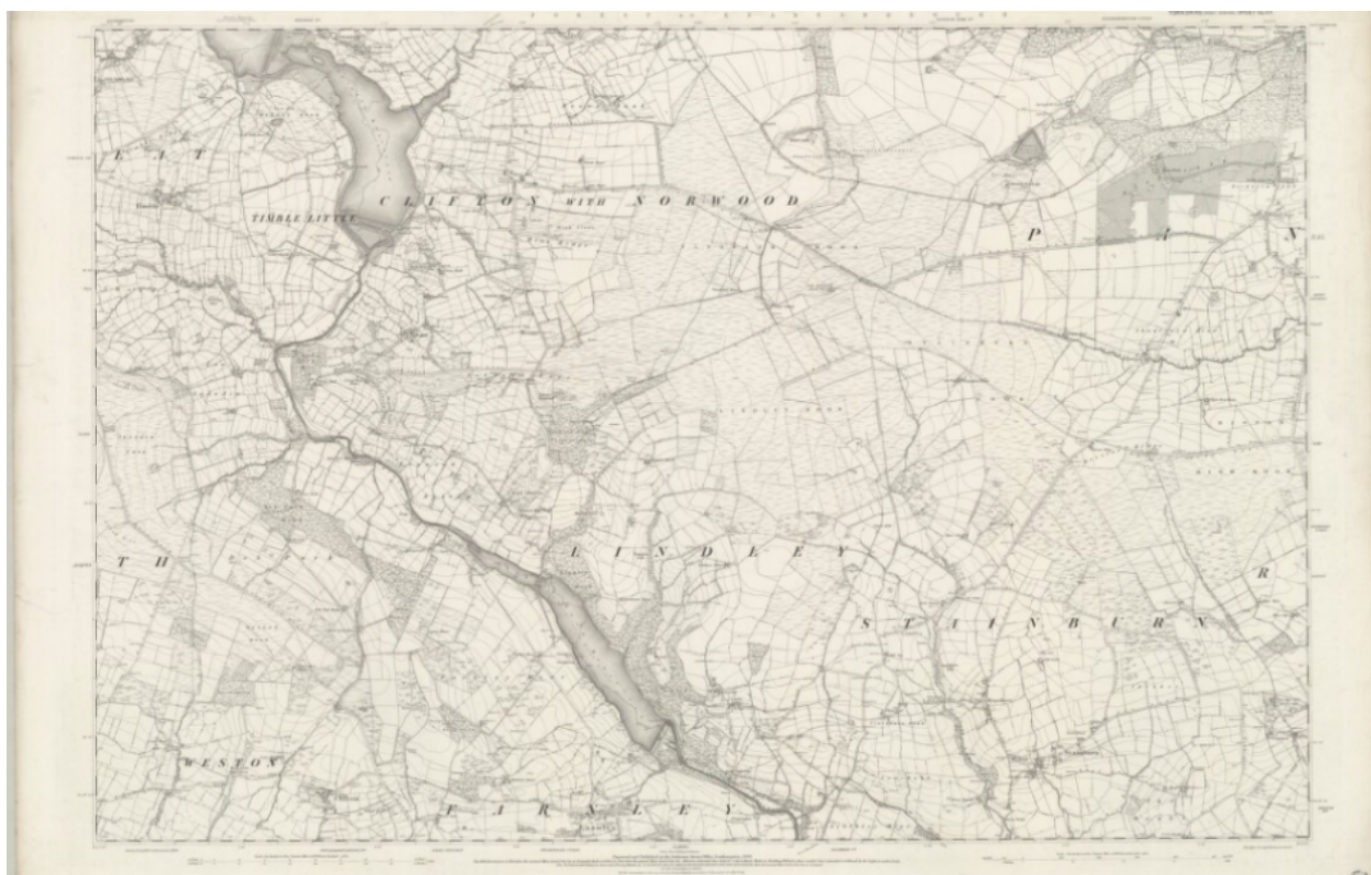
An Ordnance Survey map of the lower half of the Washburn Valley from 1893, with Lindley Wood (1869–75) in the middle, Swinsty (1870–77) in the top left corner, and the bottom of Fewston (1875–79) cut off in the top left corner.