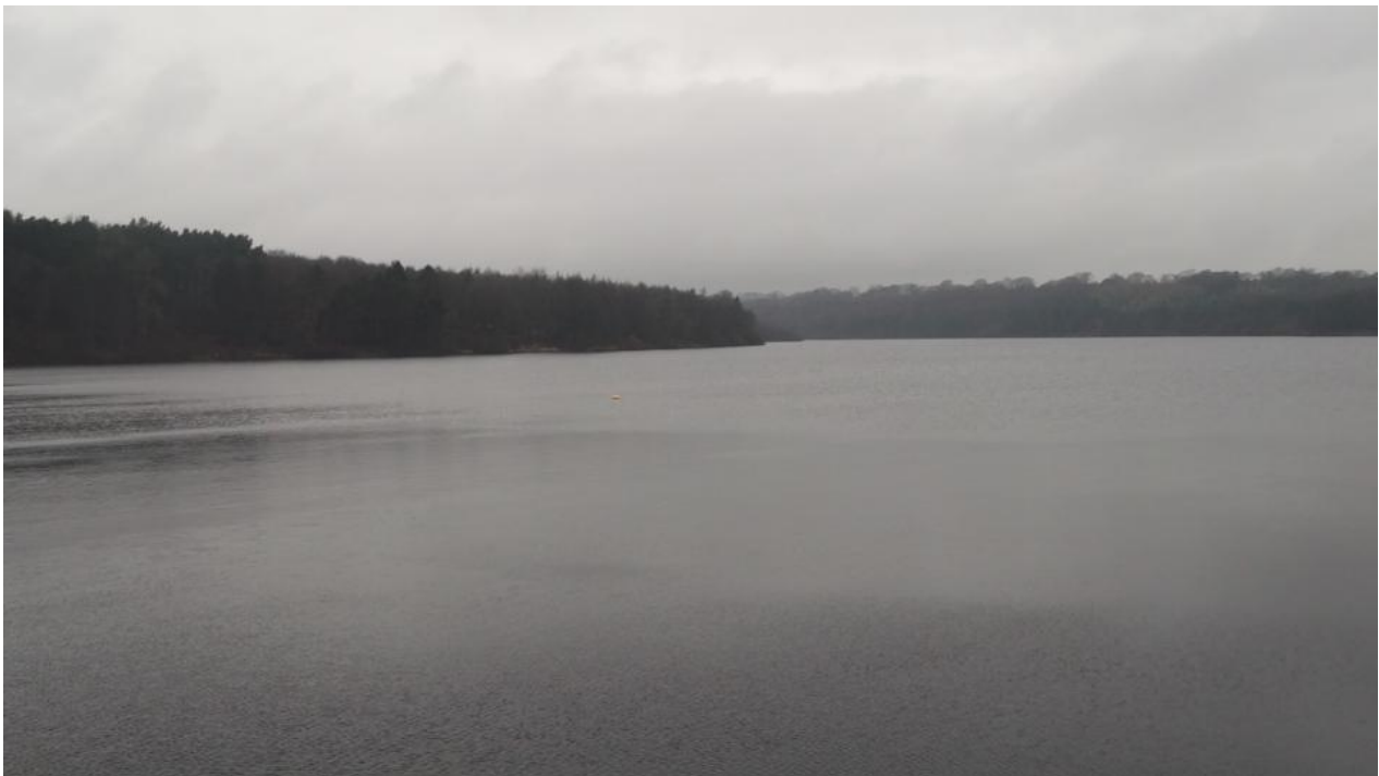
Swinsty Reservoir, on the banks of which Fewston village lies.