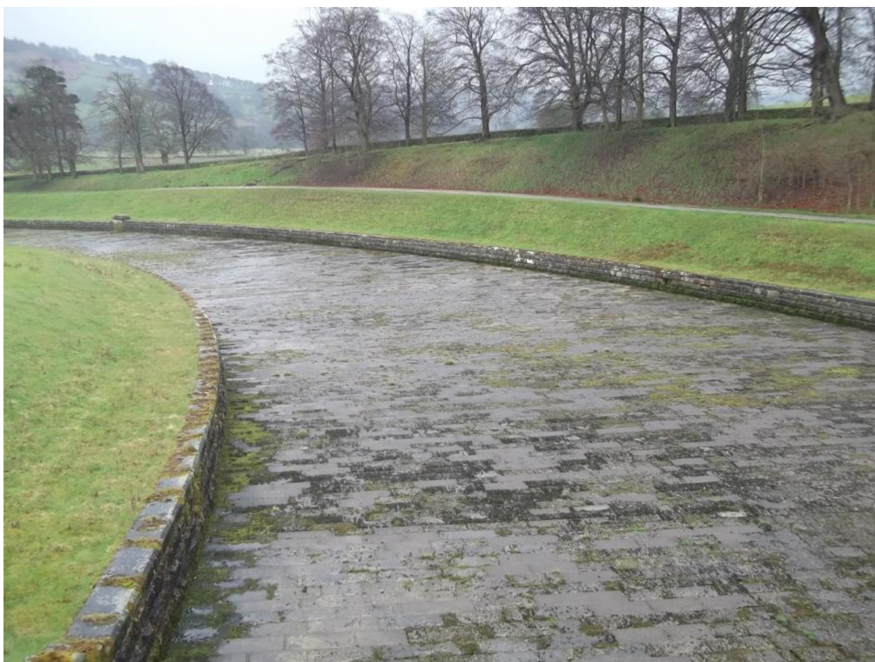
The dry by-wash at Swinsty, which allows water to flow down the valley to Lindley Wood Reservoir by means of gravitation.