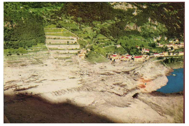
The town of Longarone after the dam was overtopped by a giant wave.

EVELICEOMAIN This work is licensed under a Creative Commons Public Domain Mark 1.0 License .