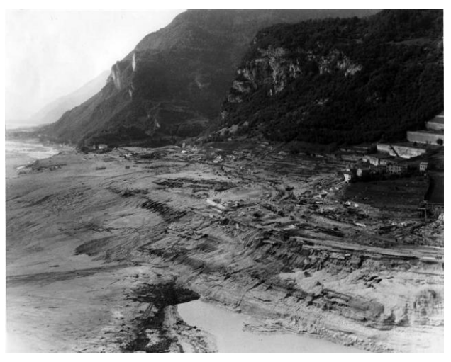
View of Longarone after the wave from the Vajont Dam (1963).

(cc) EY-NC-SA This work is licensed under a Creative Commons Attribution-NonCommercial-ShareAlike 2.0 Generic License .