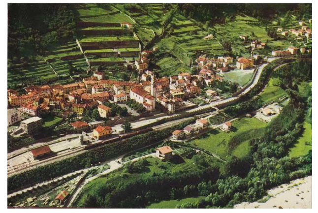
The town of Longarone, Italy, before the landslide, 1963.

On October 9, 1963, at 10:39 pm 260 million cubic meters of rock broke off from the top of Monte Toc, on the border between Veneto and Friuli Venezia Giulia. It fell into the reservoir of the Vajont Dam, producing an enormous wave of at least 50 million cubic meters of water. The dam, completed in 1959 and one of the biggest in the world at the time, did not suffer any serious damage. However, flooding destroyed several villages in the valley and killed almost 2,000 people. A third of the population of Longarone, the largest village downstream of the dam, perished.