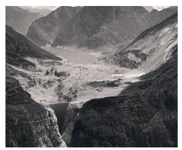
View of the Vajont reservoir after the landslide (1963).

EVELICOOMAIN This work is licensed under a Creative Commons Public Domain Mark 1.0 License .