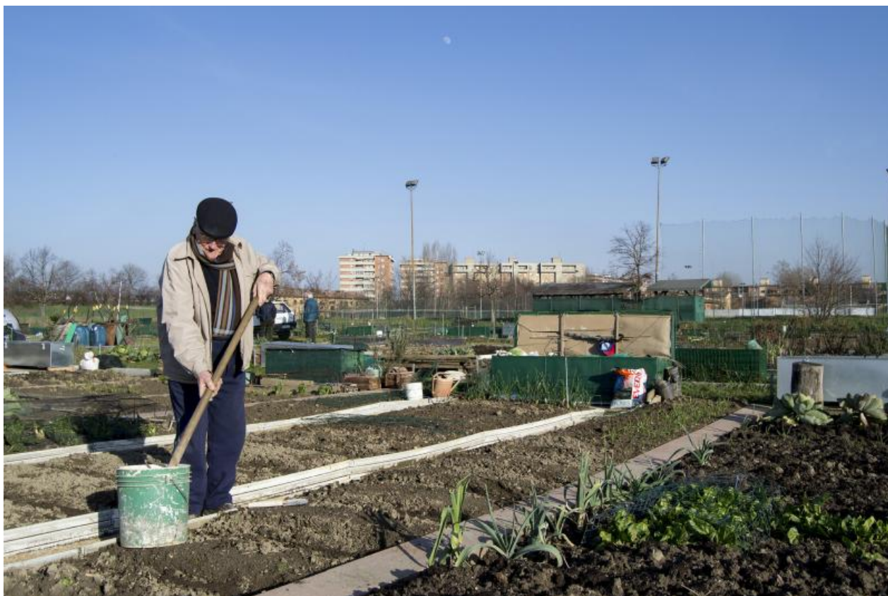
Allotments in area F in winter 2015