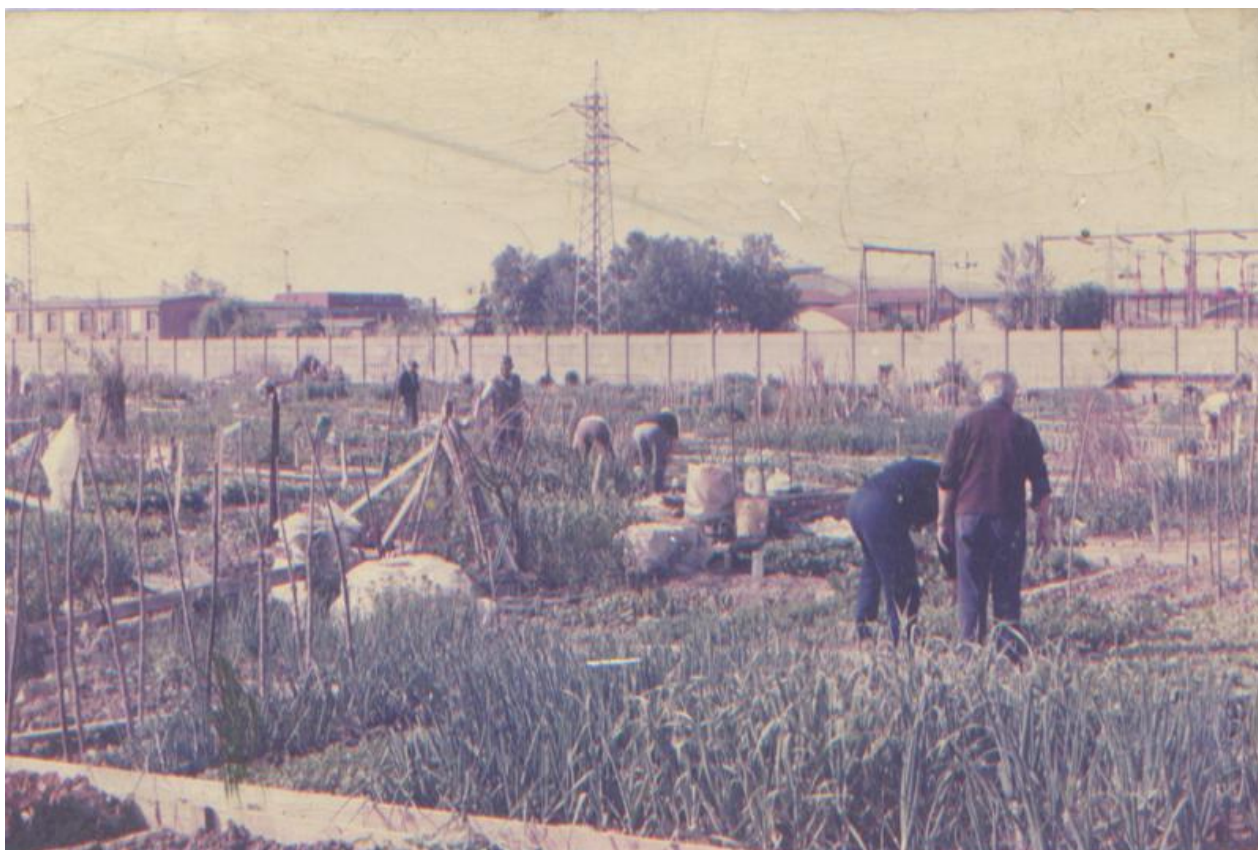
Allotments in area F during the 1980s.