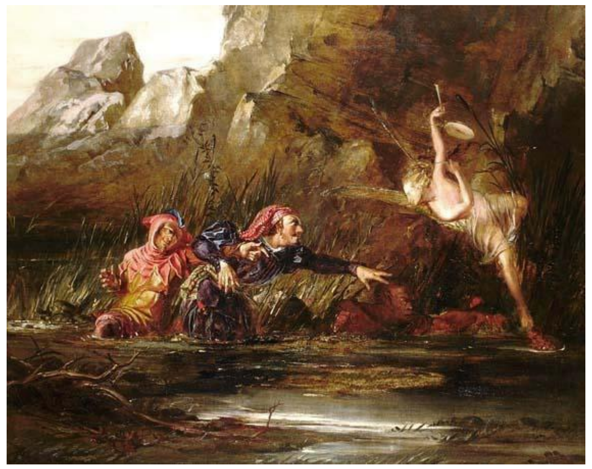
"All the infections that the sun sucks up / from bogs, fens, flats..." Ariel and Caliban by William Bell Scott, 1865. Oil on canvas.

Henshaw's invention is described as utilizing "a very large pair of Organ bellows" to help decompress the air of a chosen room through a copper pipe in the wall and into a bucket of water outside. The purpose of Henshaw's contraption was simple: to simulate the conditions of a foreign climate, with his logic being "that Lice bred on this side the Line, (or Aequator) will immediately all die on the other side the Line." Similarly, it was thought that the artificial creation of a "foreign" climate would be sufficient in deterring unwholesome, malarial airs.