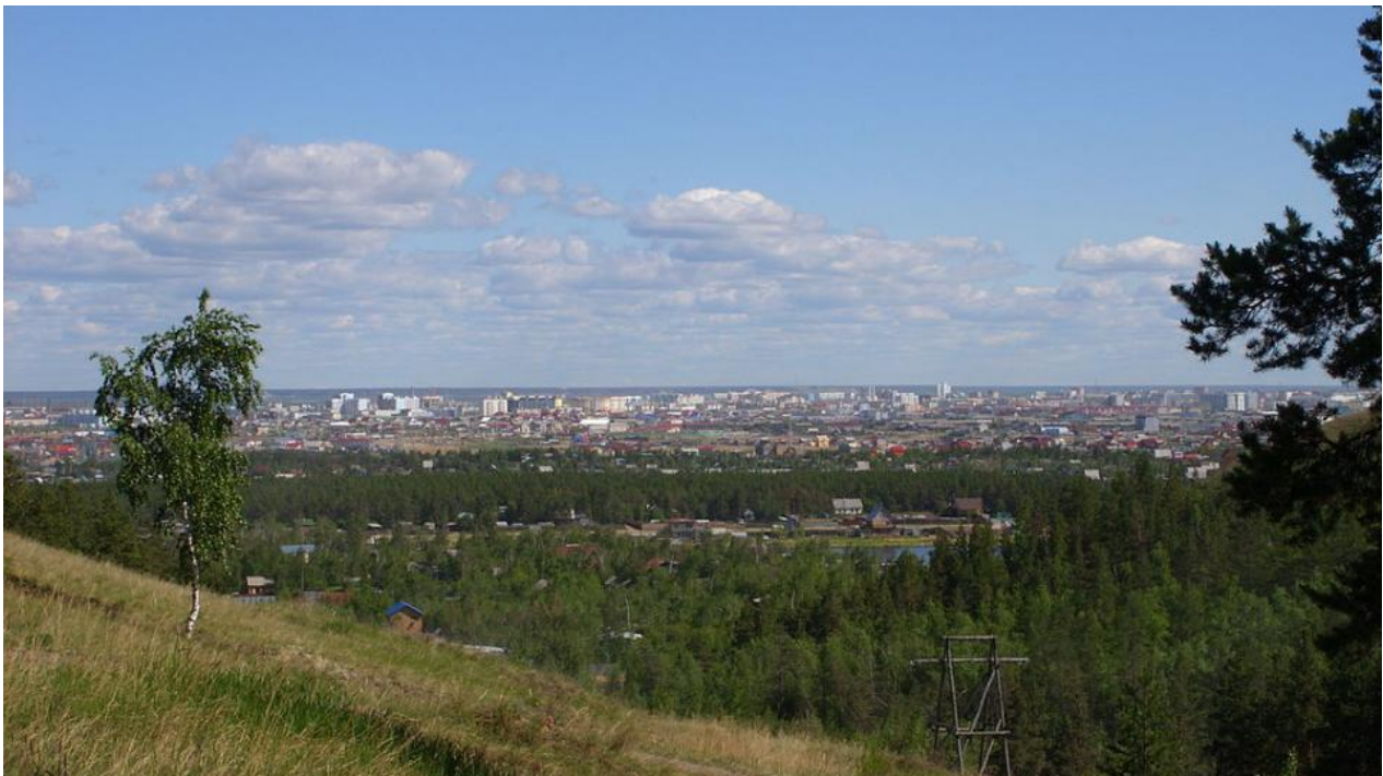
Twenty-first-century view of the city of Yakutsk. Groundwater from beneath the permafrost facilitated its urban development.

After ascertaining the presence of an aquifer, the government gave the green light for a 600-meter exploitation well near the city center. Once again, the project met with stumbling blocks. At 400 meters below the surface, the borehole began to silt up. Instead of stopping to assess the situation, workers continued drilling, exacerbating the problem. Drilling fluid ceased to circulate, and a mud plug ten cubic meters in volume became an impenetrable barrier. The head geologist made a perfunctory attempt to clear the well before pronouncing it waterless, to the consternation of officials. A scientific review determined that fissures in the stratum of water-bearing rock had become completely jammed with particulates from the drilling fluid. Instead of the clay-based drilling mud, water should have been used. Under new oversight, workers eventually evacuated the aquifer and the barrel and walls of the borehole. Blame for the accidents focused on human error, but the unfamiliar environment played a role in conditioning the mistakes.