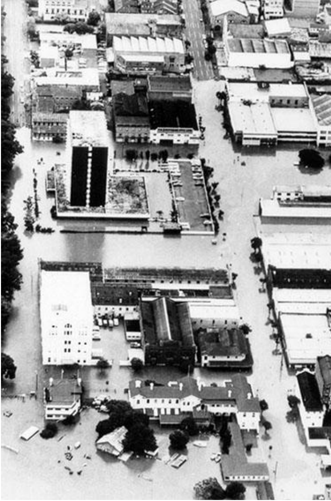
Aerial view of Alice and Margaret Streets in central Brisbane