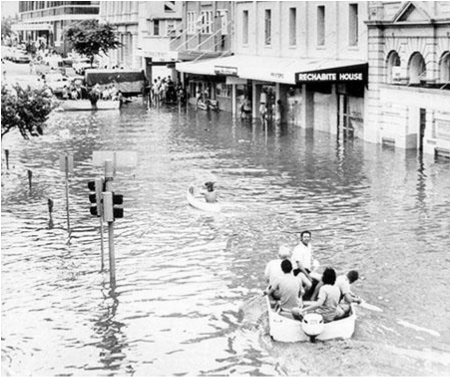
Edward Street in the city