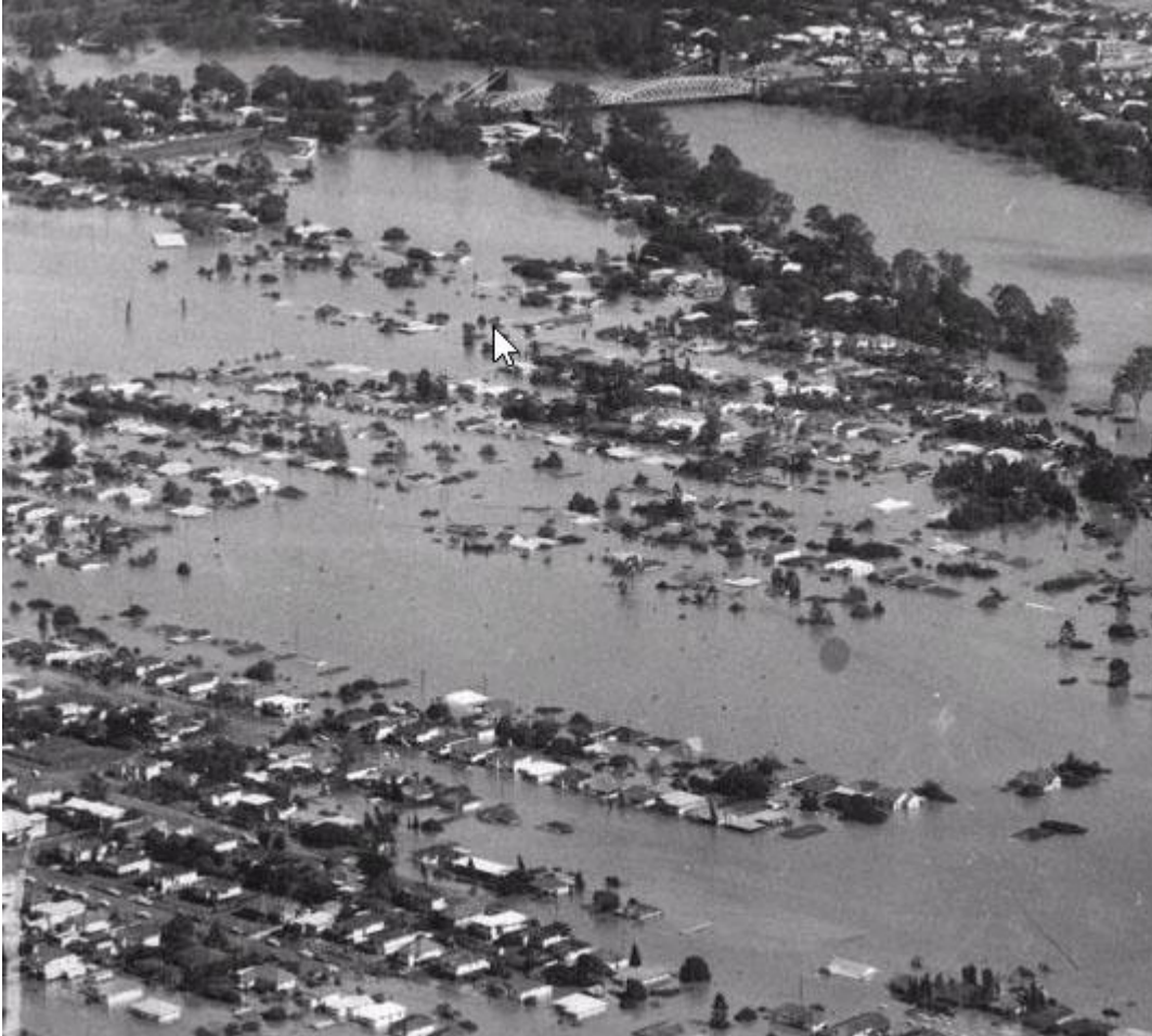
Aerial view of suburb of Chelmer where streets disappeared and houses were submerged