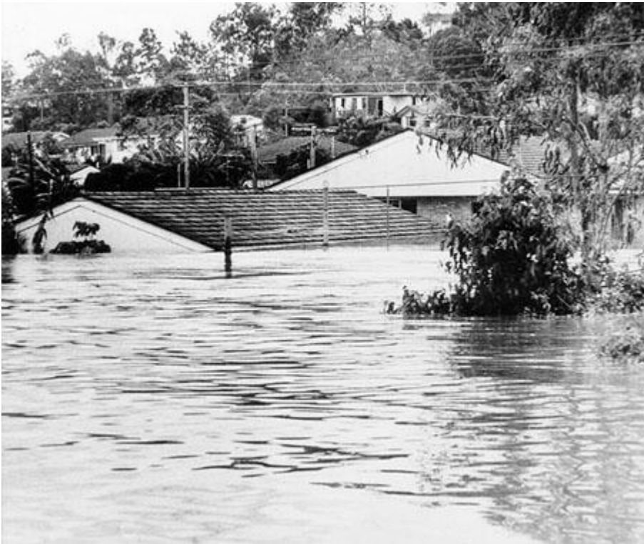
Houses submerged to roof height in the suburbs

In 1959, the Government had completed the construction of Somerset Dam, a dual-purpose structure, designed to provide water supply and mitigate floods. Much of the populace believed major floods to be a thing of the past. Consequently, urban and industrial development flourished on the floodplain in Brisbane, significantly increasing the flood hazard. As floodwaters surged towards the city, substantial damage was inevitable.