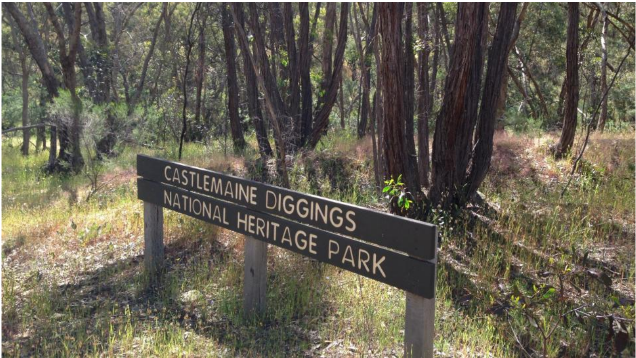
Castlemaine Diggings National Heritage Park

asserts itself in new and continuing forms. Indeed, one of the key values given as a reason for listing the park was the resilience of its natural features in the face of change. Where I'm standing looking at the nest and the kilns, I'm surrounded by a coppice forest of box trees, red stringybark, and a few ironbark trees, with fields of wildflowers mixed with introduced grasses. This is a forest quite unlike the box-ironbark forest of the Jaara Jaara that the first gold diggers would have encountered. However, this blended forest continues to support a rich array of plants and animals along with a range of threatened flora, fauna, and ecological communities. It also supports changing human relations with the ongoing recognition of Indigenous rights, obligations, and knowledge in park management.