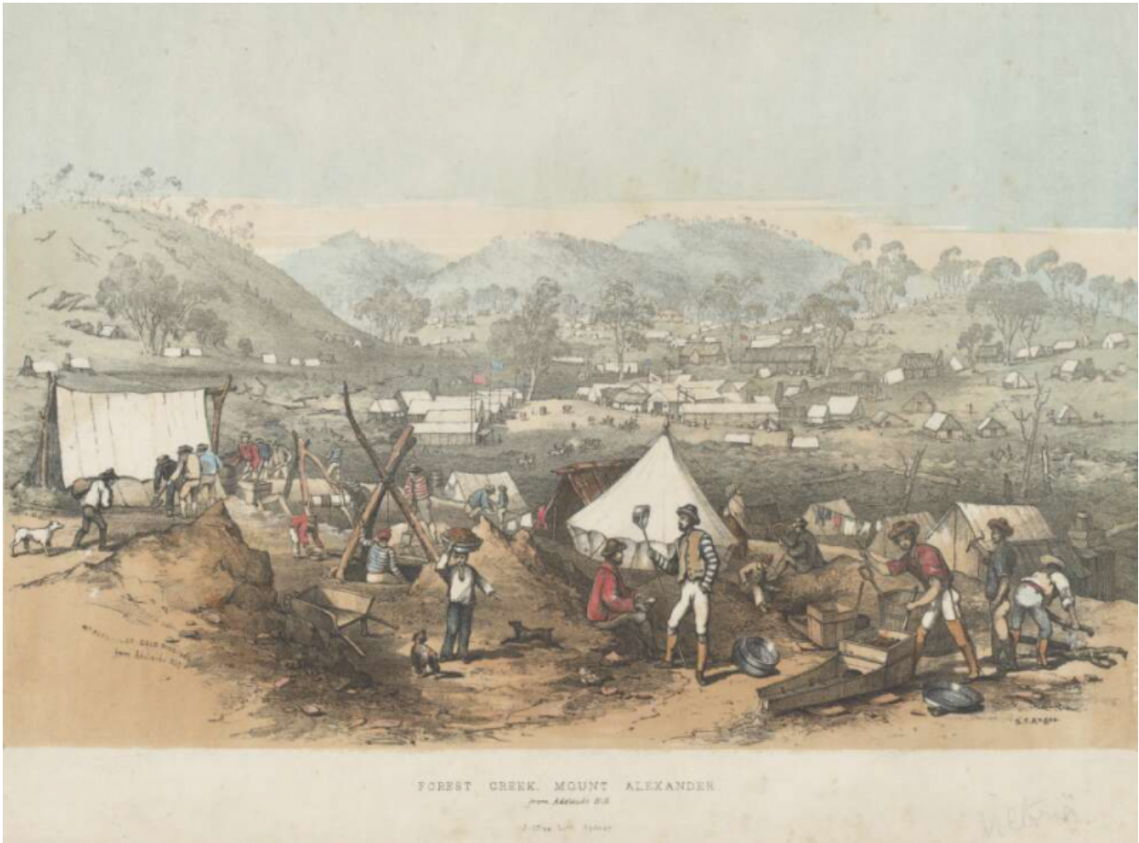
Forest Creek, Mount Alexander, from Adelaide Hill (1852)

next to, so that they could be more easily crushed with hammers to reveal the gold within. Roasting involved layering quartz and wood in the kiln, and then firing, sometimes for a week.