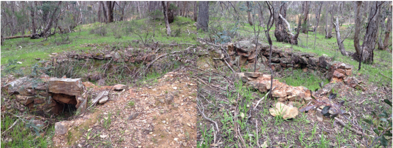
Quartz kilns, Castlemaine Diggings National Heritage Park