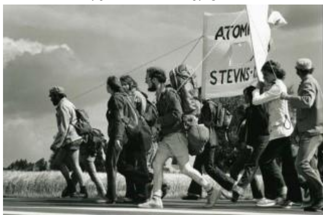
March from Stevns to Copenhagen, 26 and 27 August 1978. Energimuseet, Denmark

This work is used by permission of the copyright holder.