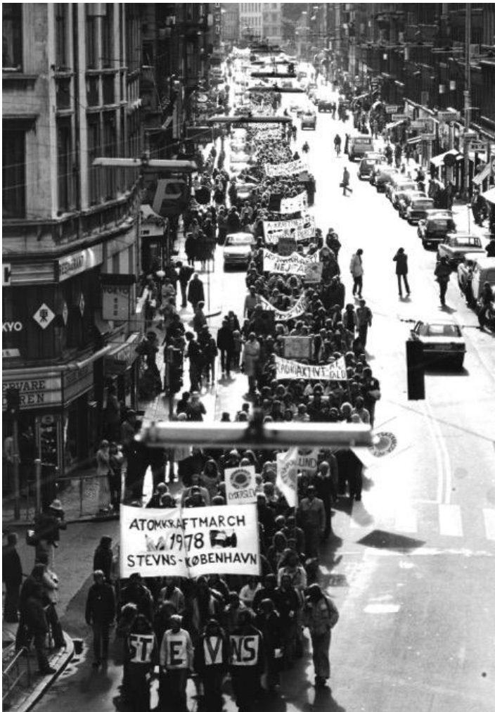
Anti-nuclear march from Stevns to Copenhagen, 1978.

Danish activism benefitted from a high level of social trust in the state and the respectful mode of interaction between politicians and activists. However, the OOA activists criticized the political handling of violent confrontations and occupations in other countries—for instance, at the building site in Brokdorf in northern Germany, where individual OOA activists had participated. In the Danish activists' discourse, these events served as examples of moral degradation and the evolution of a police state concomitant with the introduction of nuclear energy. Hence, their attitude was ambivalent: on the one hand, Danish anti-nuclear activists considered the violent demonstrations as a legitimate way for citizens to express their discontent with what they criticized as harassment by the authorities and attacks against democratic rights; on the other hand, Danish activists were not keen to organize similar protests that would harm their cause and provoke disaffection among the Danish citizens.