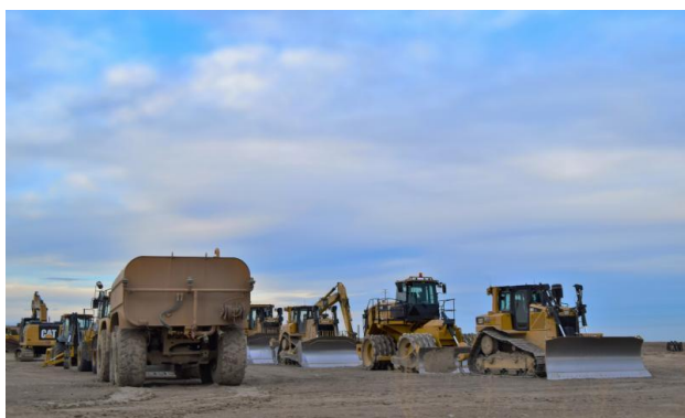
Development of the Candelas estate

the Terra Causa Capital and GF Properties Group, a subsidiary of the Southern Ute Indian Tribe. The new residents of the freshly constructed village of Candelas are commuters to the nearby city of Denver, and are unaware of the legacy of contamination that surrounds Rocky Flats.