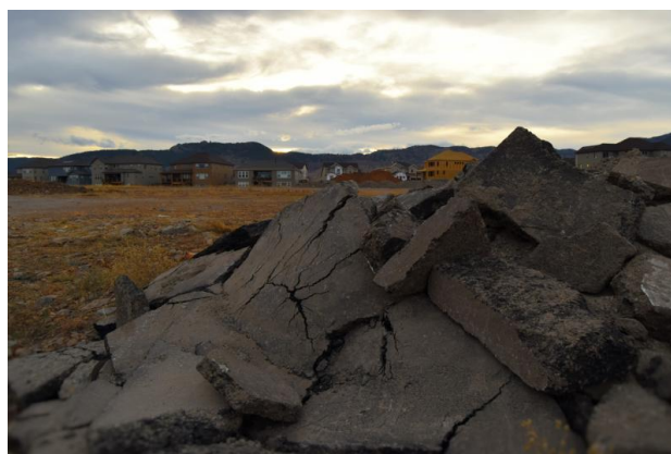
The Candelas estate

This work is used by permission of the copyright holder.