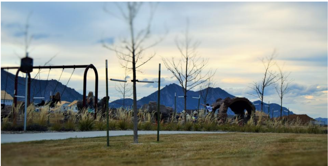
Children playing in a park near Rocky Flats

This is an issue of procedural inequity that environmental justice scholars have noted in many other cases of contested illness. In cases of contested illness, affected members of the public perceive connections between their illnesses and exposure to environmental toxicants such as plutonium, but medical professionals and/or state or federal agencies deny either the existence of their disease (as with Gulf War Syndrome) or deny an environmental health component to the disease (such as asthma rates increasing in relation to air pollution).