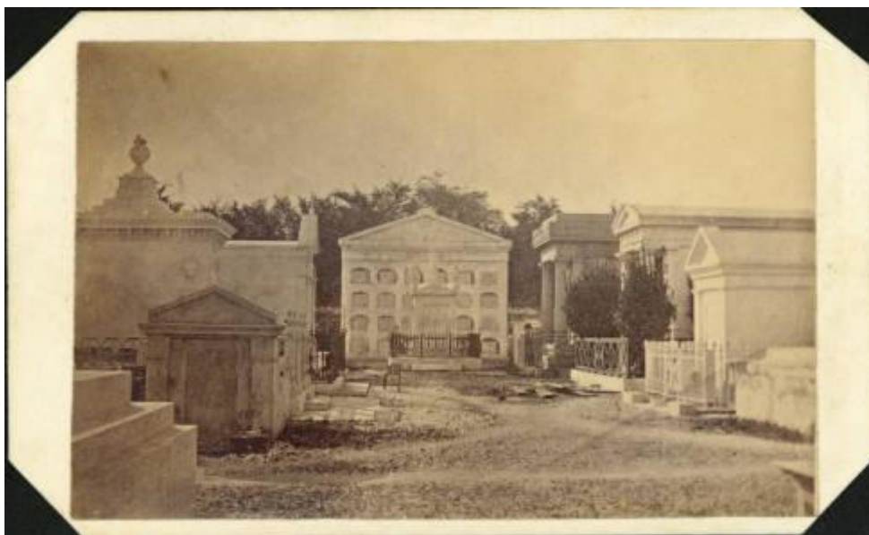
St. Louis Street Cemetery, ca. 1864. Yellow fever victims filled the city's cemeteries, which grew and became increasingly ornate in the 1830s and 1840s.