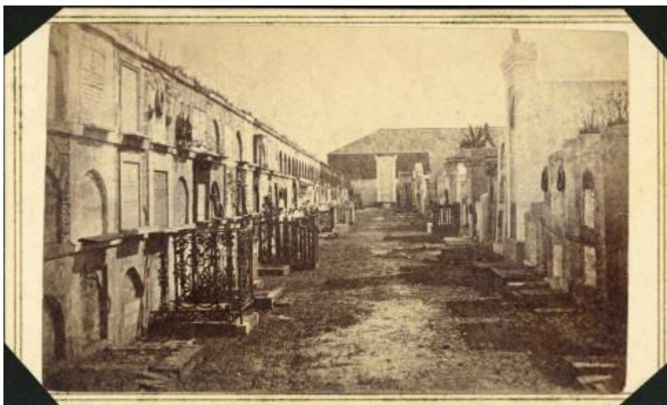
Girod Street Cemetery, ca. 1864. Architectural ornamentation created new breeding opportunities for A. aegypti .

L. I. Prince, "St. Louis Street Cemetery," Marshall Dunham Photograph Album.