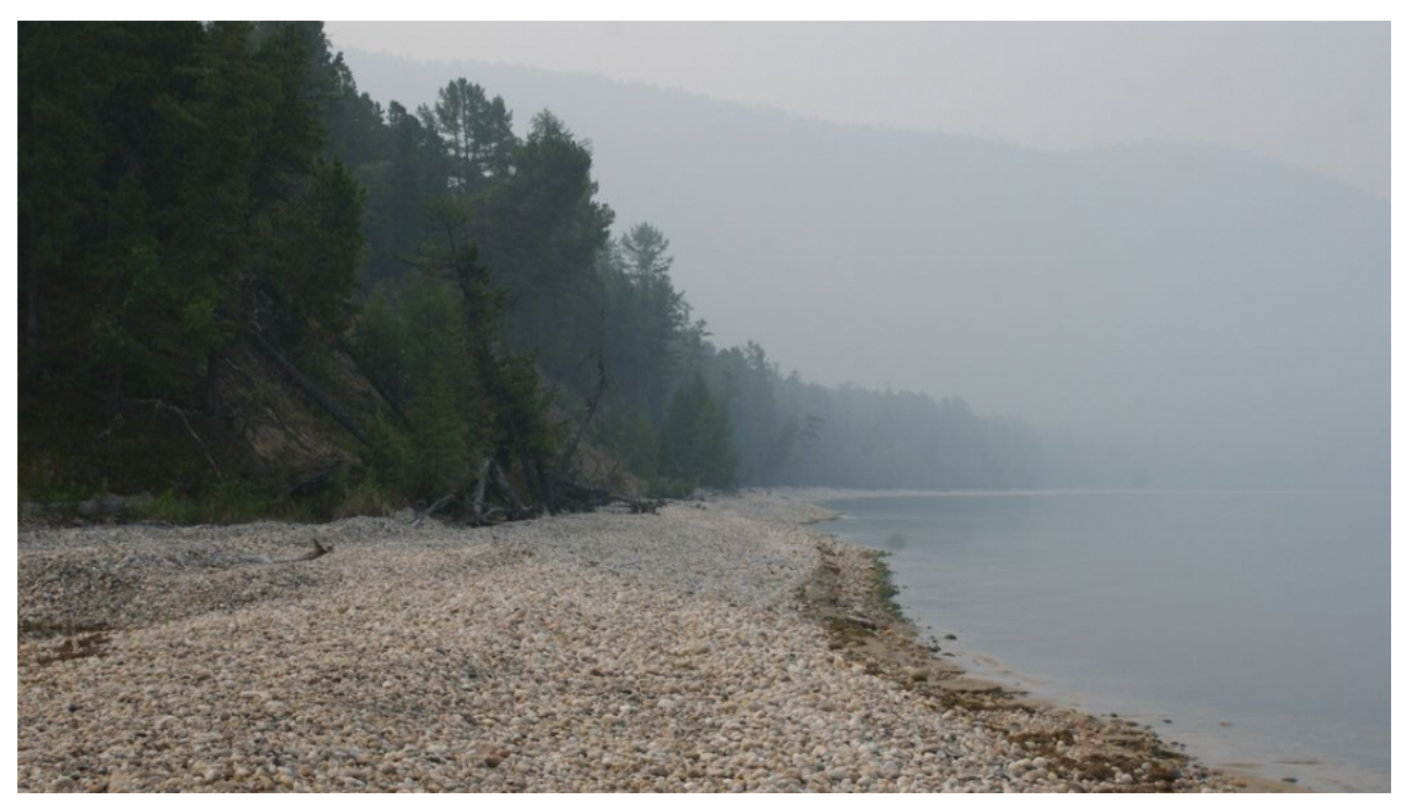
Smoke from forest fires over Lake Baikal

threatened by pollution from cellulose plants built on its shores from the 1960s. After a long struggle they have finally been closed. A dam built in the 1950s at Irkutsk on the Angara River, which flows out of the lake, remains. Further dams planned for tributaries of the Selenga River, which flows into the lake from Mongolia, may pose further threats. While we were there we witnessed the lake shrouded with smoke from forest fires caused by lightning strikes, which are natural, but also by careless tourists and in conditions more prone to fire due to a changing climate, which are threats caused by humans. Thus our bears, like their fellow bears and human neighbors around the globe, face a constellation of threats from both natural and anthropogenic sources.