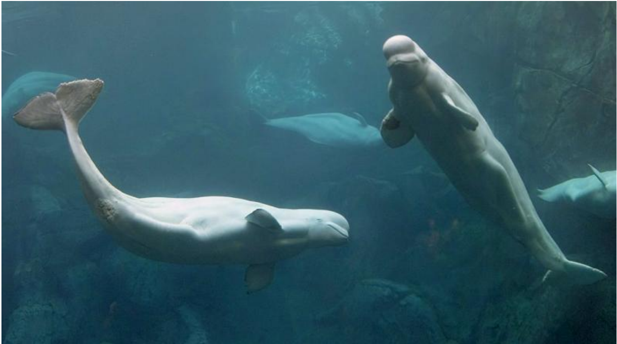
Beluga whales ( Delphinapterus leucas ) in an aquarium