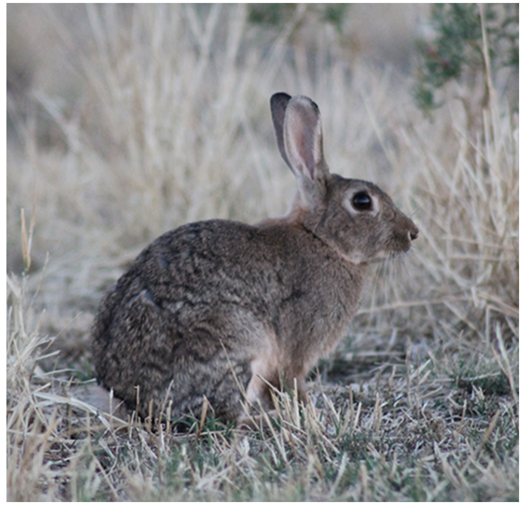
European rabbit, Oryctolagus cuniculus

pests in all states and territories across Australia and it is a legislative requirement that all public and private landowners take action to manage population numbers on their land.