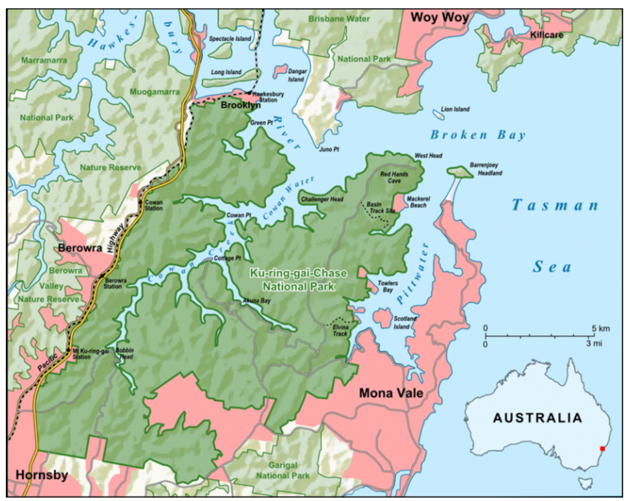
Map of Ku-ring-gai Chase National Park

This image was created by Lencer. Click here to view Wikimedia source.