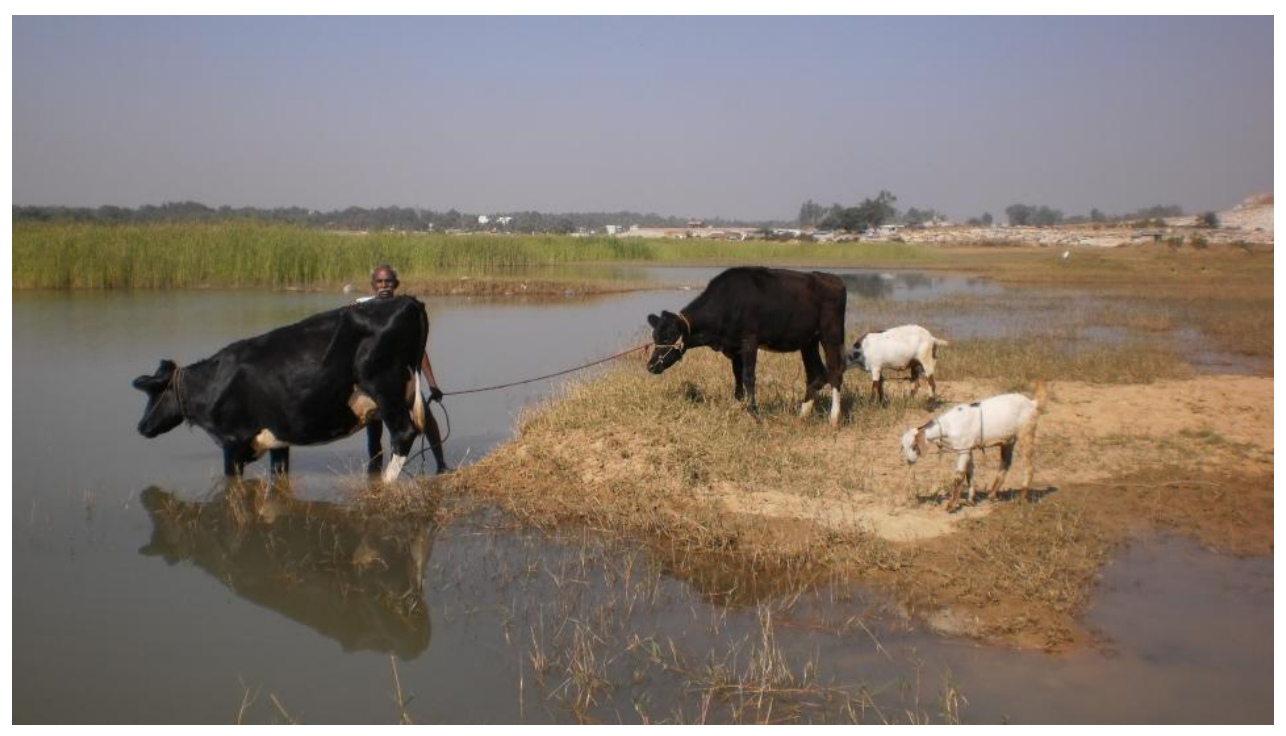
Figure 5. Grazers washing cattle in a lake in Bangalore

recent years, following widespread water shortages across Bangalore and occurrences of large polluted lakes frothing and even catching fire, the importance of lakes for ground water recharge is now recognized. Since the mid-2000s, many lakes across the city have been restored through the efforts of local communities working with the government. Yet such restoration typically involves fencing and restrictions on lake access (Figure 3), enforced by security guards. Such a vision of the lake favors recreational use, while banning consumptive use by fodder collectors, fishers, migrant labour and washer communities (dhobies) to name a few (Figures 4 and 5). This has distanced many low-income communities from lakes they once actively engaged with and managed for centuries. This, despite the fact that these lakes still continue to support and sustain several livelihoods through the agriculture, fishing, livestock rearing, and foraging activities they enable.