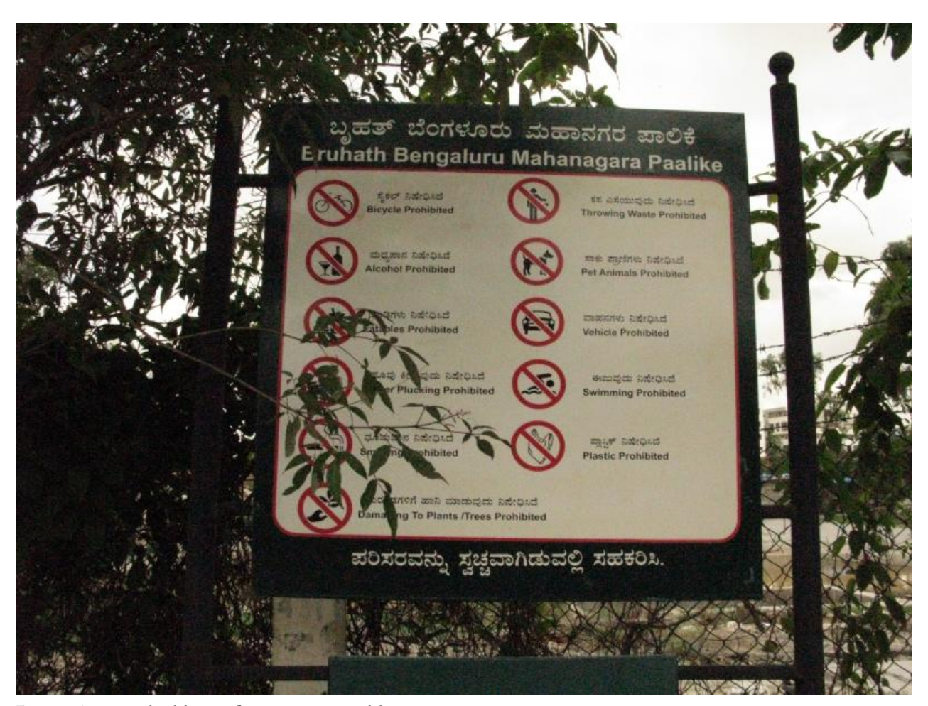
Figure 3. A sign inside a lake specifying restrictions on lake use