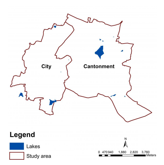
Figure 2. Presence and distribution of lakes in the city of Bangalore, 2014\,

This work is used by permission of the copyright holder.