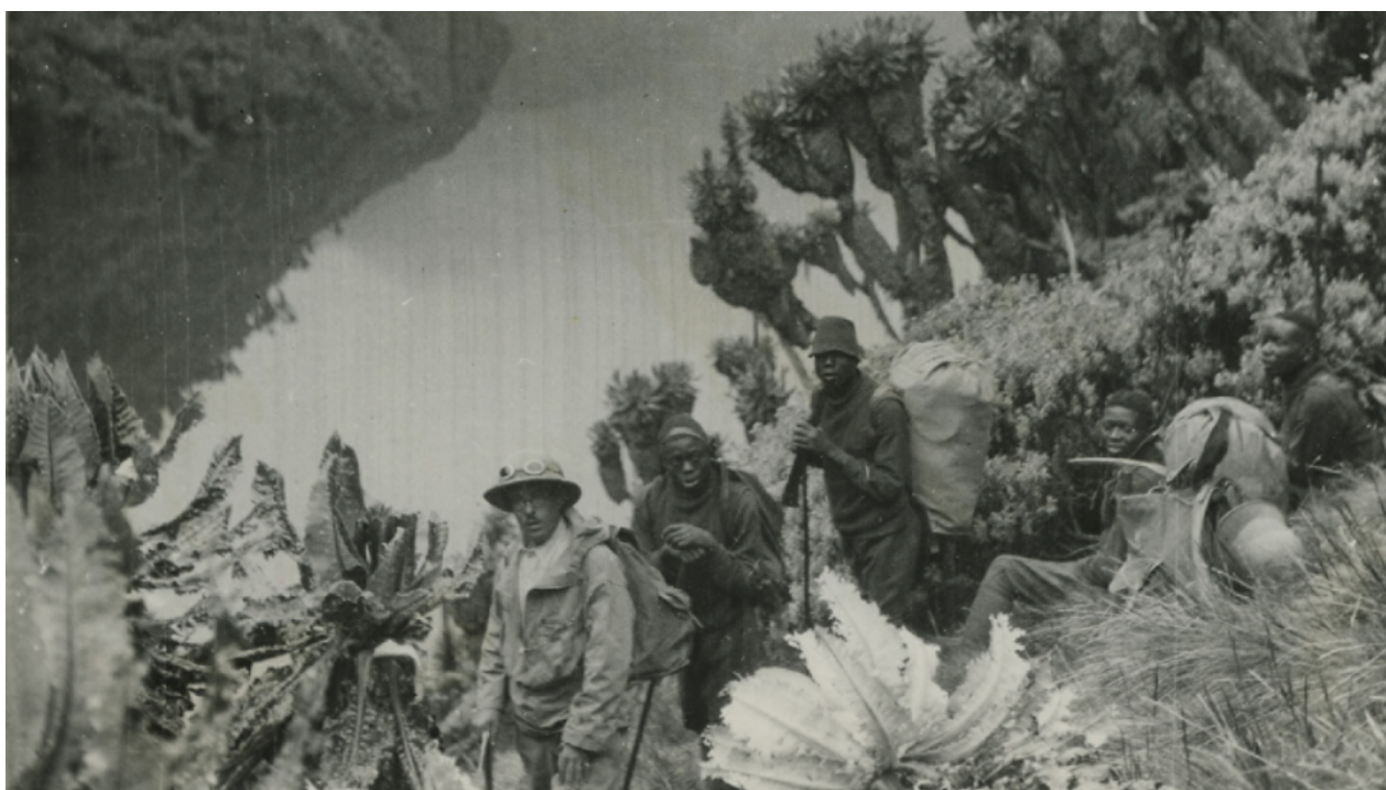
Members of the Belgian scientific mission to the Ruwenzori region (on the north side of the Park), 1932