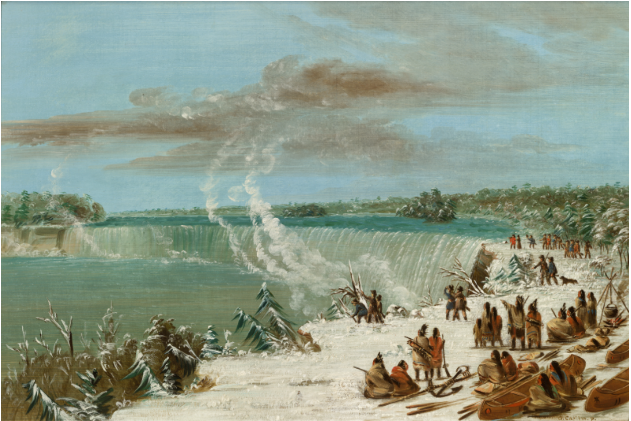
Fig. 1. George Catlin's mid-nineteenth-century painting of Niagara Falls illustrates the steep cliffs of the Niagara carrying place where Seneca warriors attacked vulnerable British soldiers travelling between Lakes Erie and Ontario.

Oil painting by George Catlin (1796–1872). Click here to view Wikimedia source.