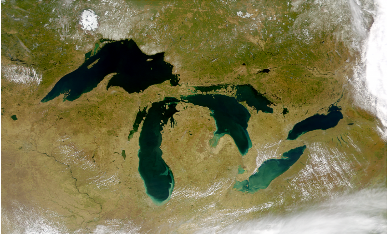
Fig. 2. Note the narrow rivers and straits connecting North America's largest freshwater bodies. During Pontiac's War (1763) these were the places where Native Americans and British soldiers fought and died in the highest numbers.

Native Americans to violence included disputes over land, diplomatic insults, the disruption of French trade practices, the curtailment of gift giving, and the Delaware Prophet Neolin's pan-Indian spiritual movement. Indians participating in the attacks included Senecas, Delawares, Shawnees, Ottawas, Wyandots, Hurons, Potawatomis, Ojibwes, and Miamis. Recent scholarship on Pontiac's War illuminates how local factors, past experiences with British officials, and the disruption of the fur trade produced divergent Indian responses to the hostilities. Nonetheless, representatives from these nations coalesced into an effective military alliance whose accomplishments altered the trajectory of British North America.