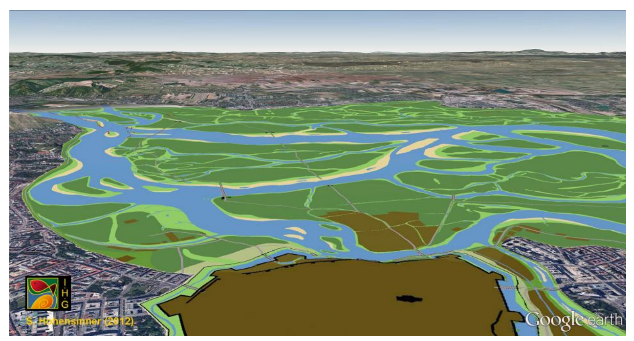
View from the historical city centre over the Danube river landscape towards north in 1570 (FWF Project-No. P 22265-G18)