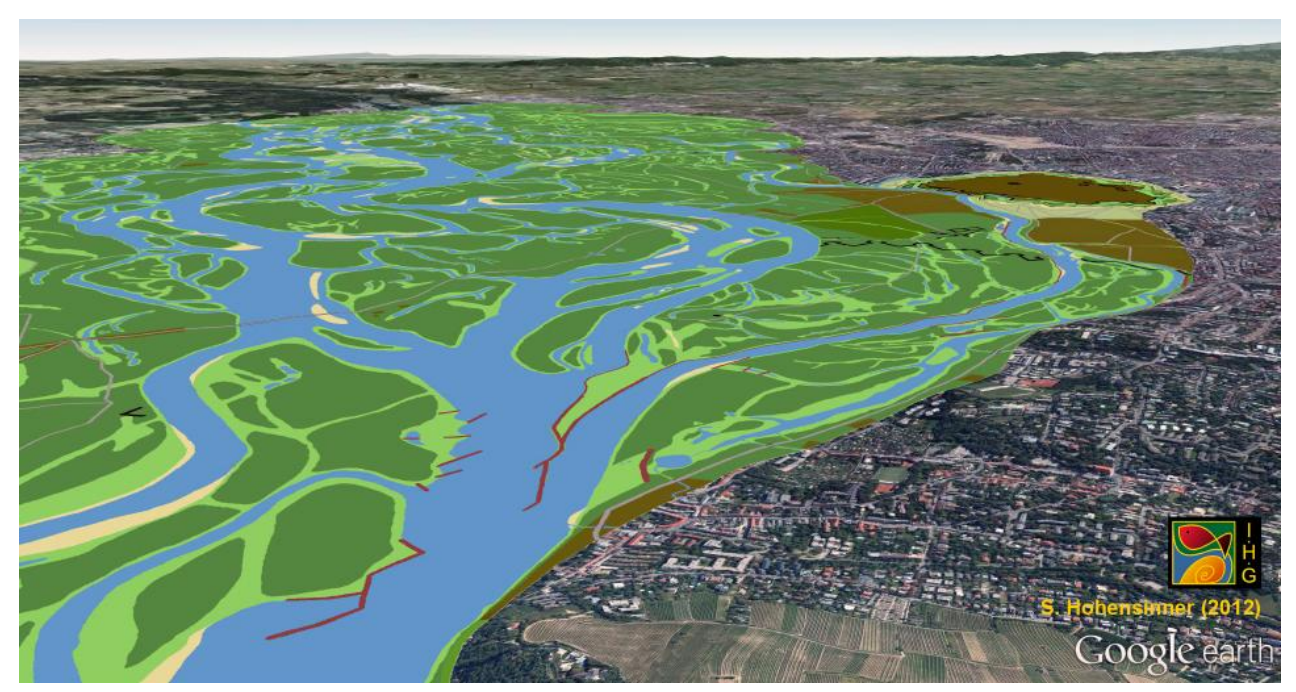
Until 1726 elaborate hydraulic structures were erected (in the foreground) to secure the flow and the navigability in the side arm towards the city centre.