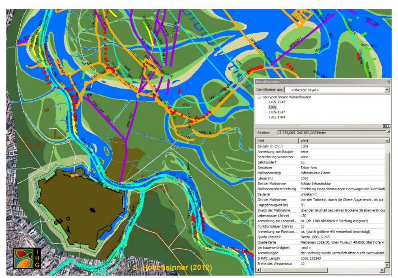
A GIS data base comprising 1800 historical river engineering measures (1200 – 1900 CE) was established for the reconstruction of the Viennese riverscape.