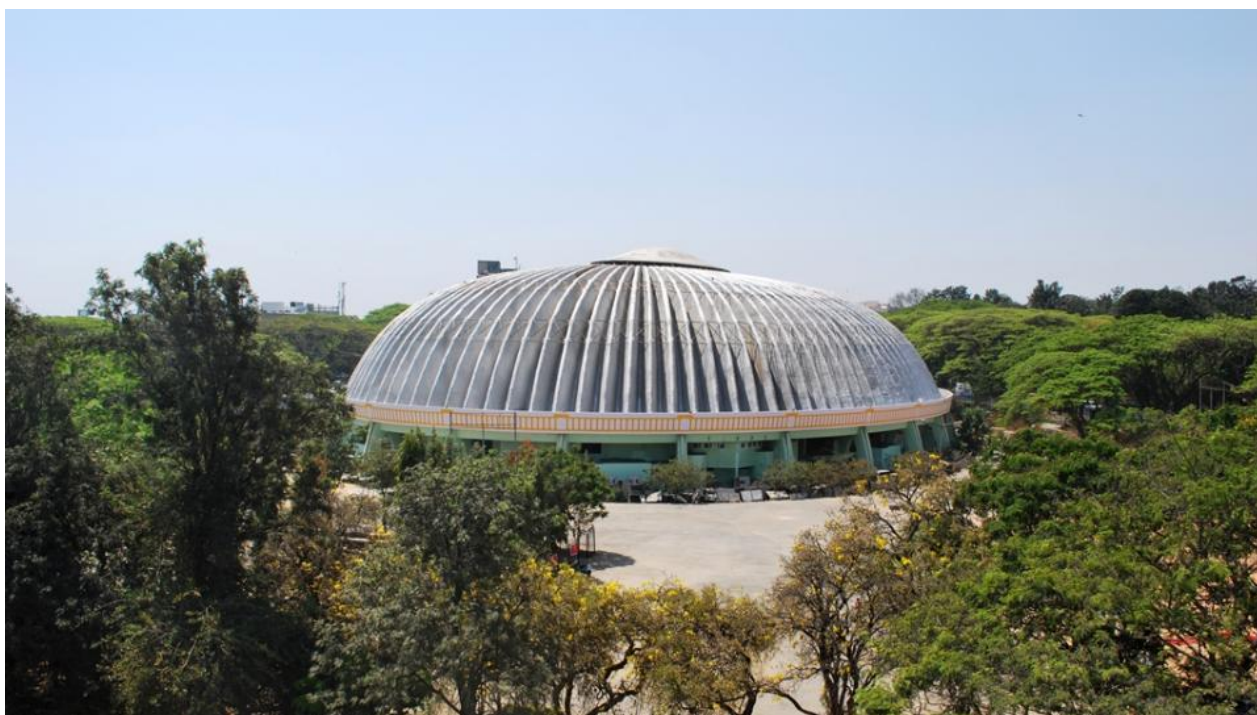
Fig. 5. Sri Kanteerava Indoor Stadium in 2012

perceived as a hazard to life (on account of incidents of drowning), and a health hazard. Urbanization, increase in land prices, and a change in perception of the utility of the lake catalyzed its conversion into a built-up space. As Bangalore grew into a twentieth-century city with an aspirational modern identity, the lakebed was converted into the Sri Kanteerava indoor sports stadium. The landscape around Sampangi now retains little of its former ecological and social importance. Only the small rectangular tank of water remains, because of its centrality to the Karaga festival.