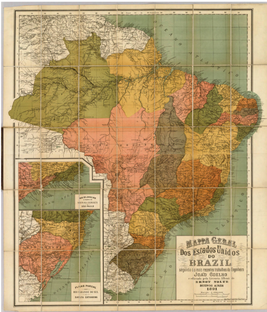
Brazil's territory around the end of the nineteenth century.