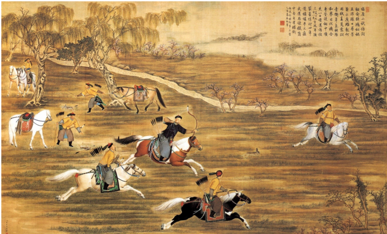
Hunting scene in the imperial hunting ground of Mulan (Mulan, Hebei): The representation of Chinese nature by a European baroque painter at the Qing court. Detail from Giuseppe Castiglione, The Qianlong Emperor Hunting Hare , 1755.

Painting by Giuseppe Castiglione, 郎世寧 (1688–1766).