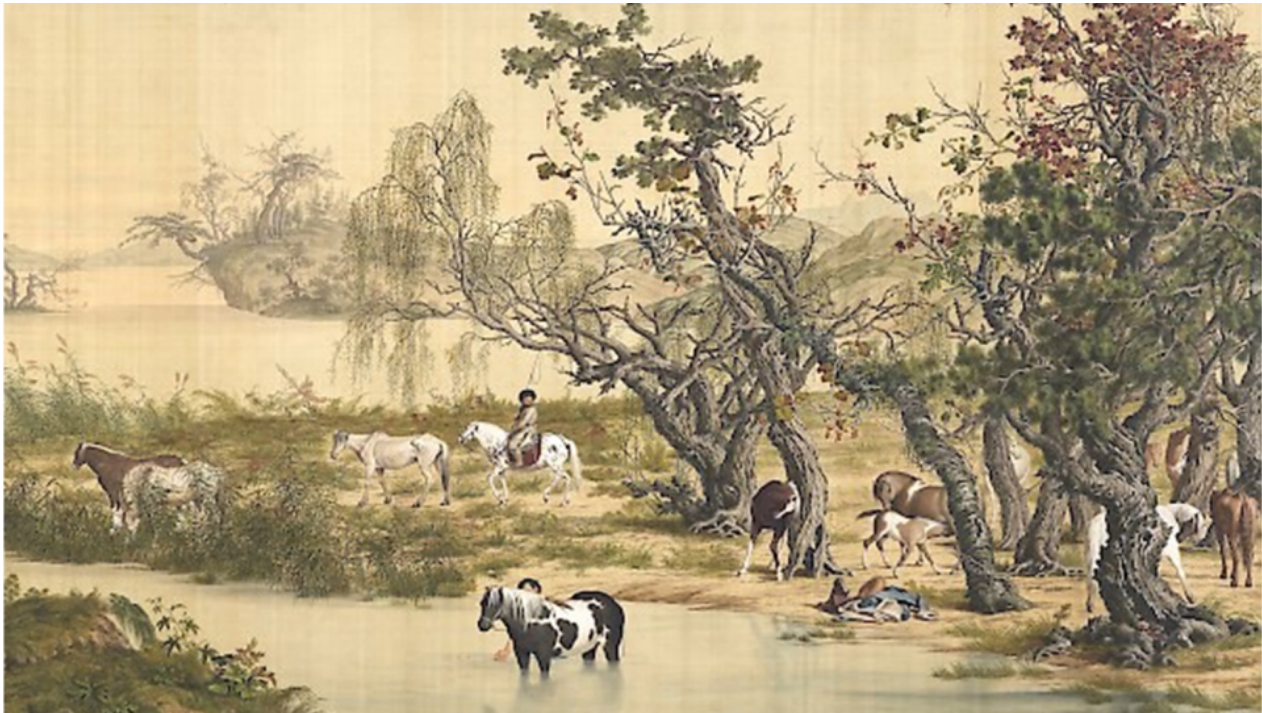
The imperial pastures of Mulan (Ulan Butong, Inner Mongolia): The representation of nature by a European baroque painter at the Qing court. Detail from Giuseppe Castiglione, One Hundred Horses , 1728.

Painting by Giuseppe Castiglione, 郎世寧 (1688–1766).