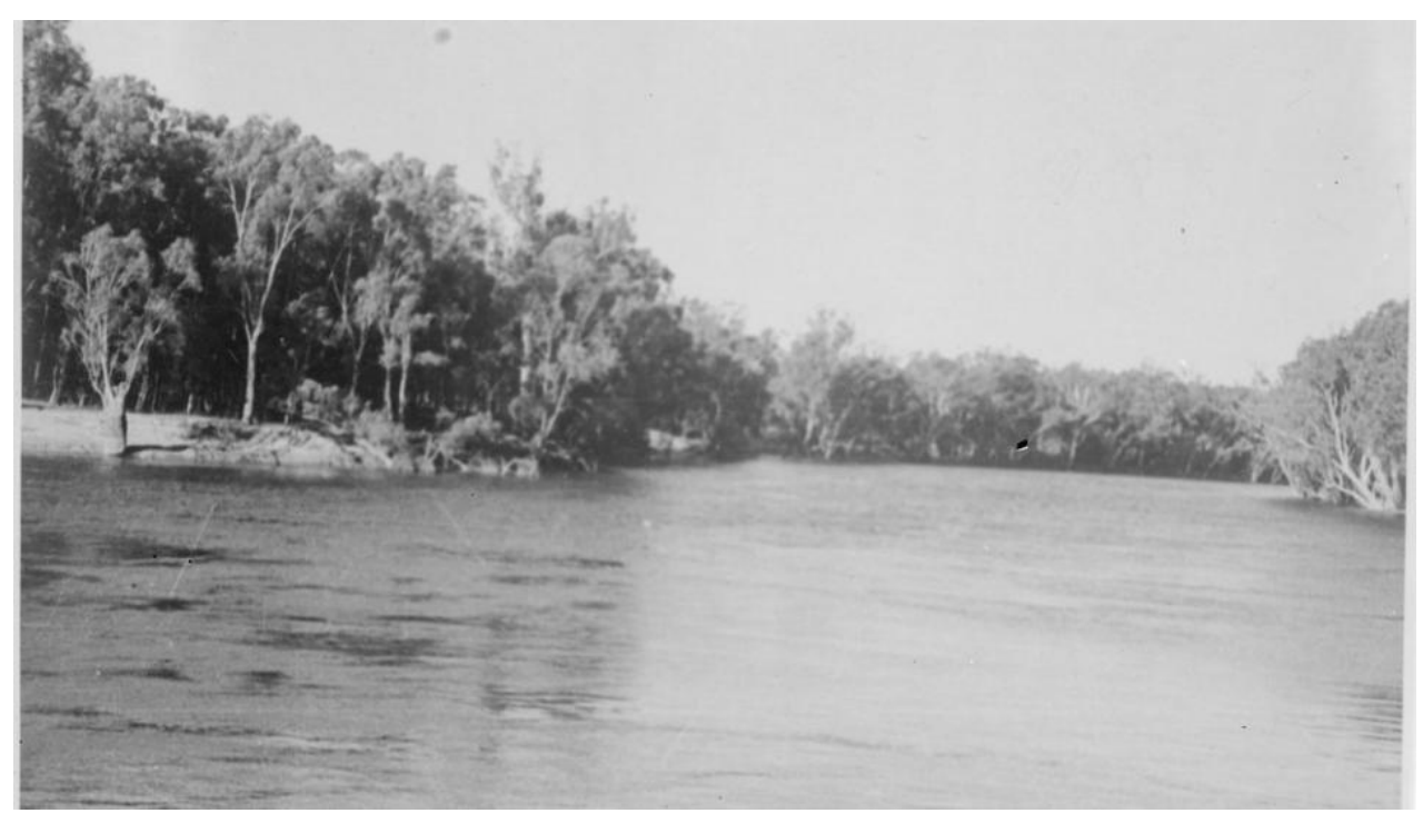
Photograph of the Murray River at Echuca, showing the river red gum trees that lined the riverbanks. Ca. 1900–1953.

But where in Australia would be the most suitable location to cure the tuberculous? While the pure, cold mountain air of the alpine regions appealed to some medical professionals, others believed the cure would be found in the dry, sunny plains of southern mainland Australia. One popular destination for these voyages was the Port of Melbourne, in the Colony of Victoria. However, the metropolis lacked the resources to care for the influx of unwell migrants, and these tuberculous newcomers were feared to be spreading their disease throughout the city. Those who could muster the strength to travel overland often headed north, to the drier and warmer inland areas. One family who did this was the Serjeant family, who arrived in Melbourne in 1888, eventually settling in the river port town of Echuca. In 1889, the Serjeants and a Madame Varley opened a charitable sanatorium in the town that was financed by donation and cared solely for the tuberculous.