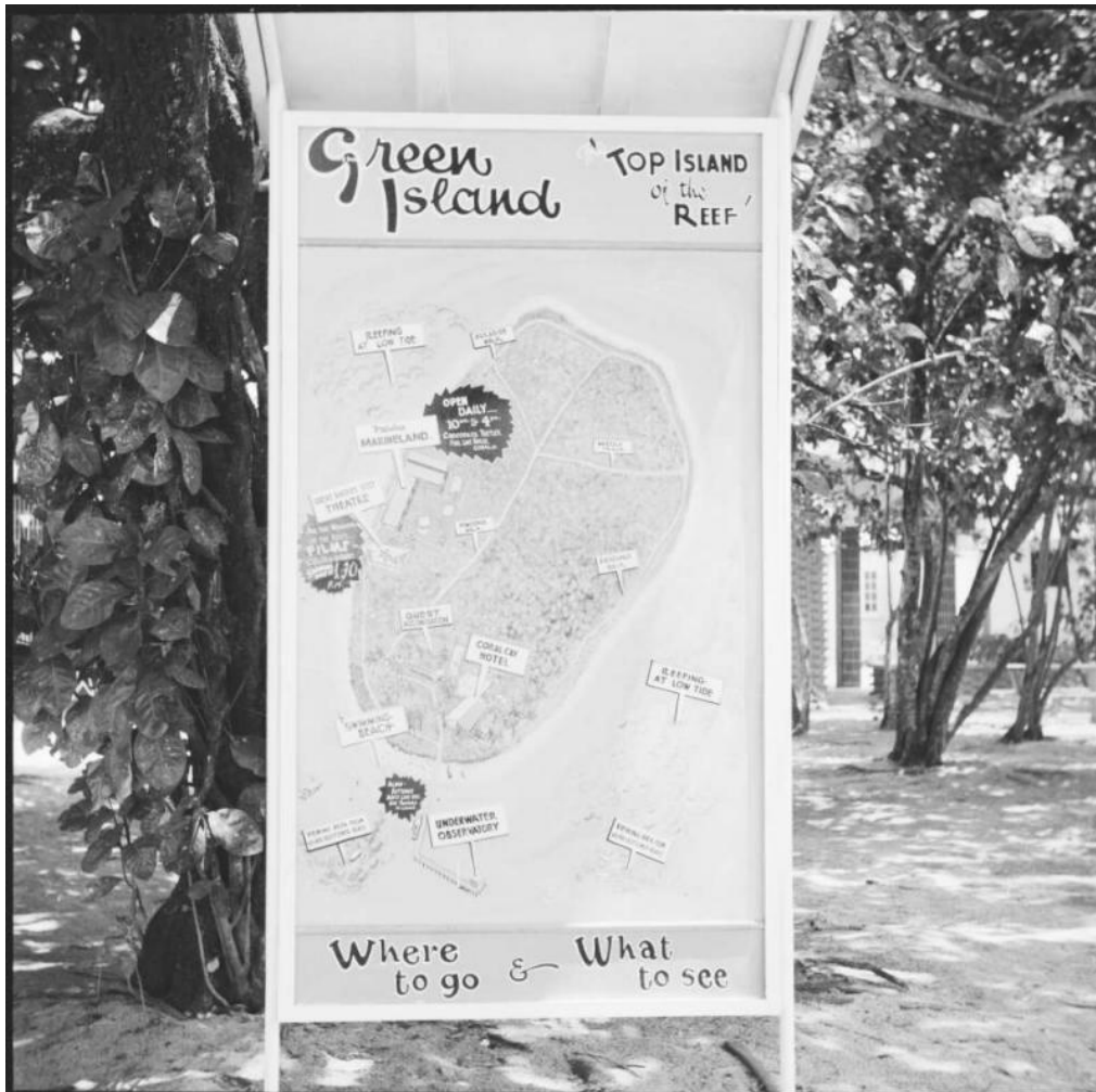
Green Island map showing locations of the underwater observatory and Marineland Melanesia, 1963.