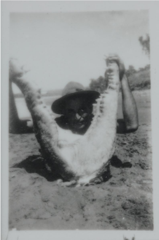
Photograph of a crocodile hunter posing with a dead crocodile at Timber Creek in the Northern Territory, 1951.

opportunity to collaborate in extending the operation. Henri's skill at promotion attracted southern sportsmen to the north to participate in crocodile safaris, and the cruises ran for a decade. The Tropic Seas could accommodate only six paying passengers at a time, so the Club went on to establish a land base (accessible by air) at Karumba in the Gulf of Carpentaria in 1952. The Gulf Country Club was one of the earliest Australian safari camps.