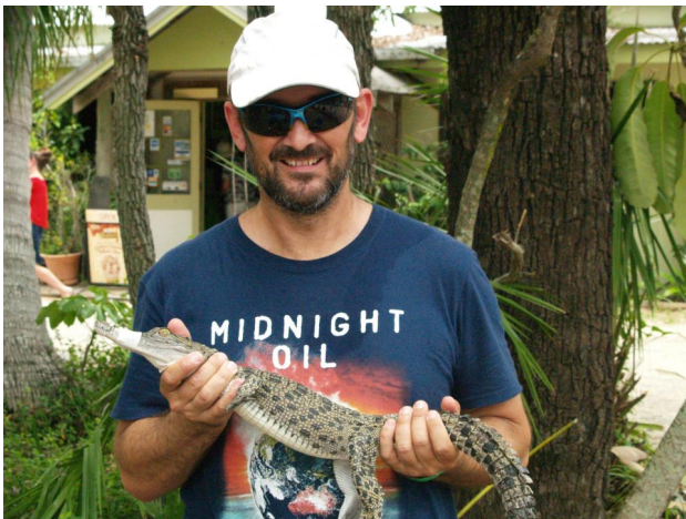
Tourist visiting Koorana Crocodile Park in tropical Queensland, 2018.