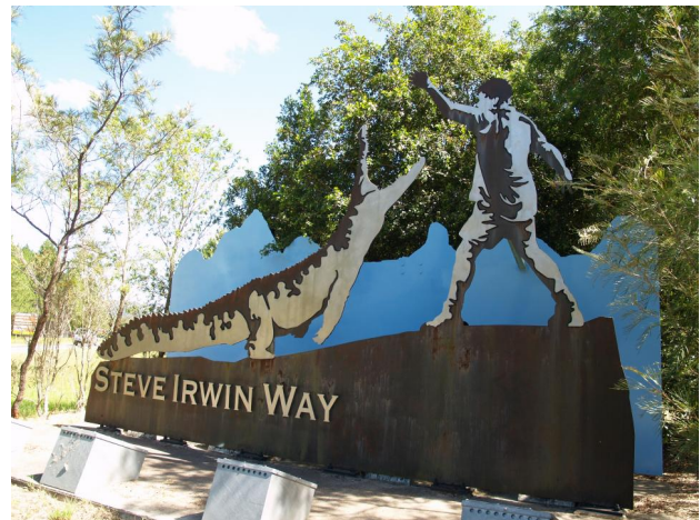
A monument featuring Steve Irwin (and crocodile) on the Sunshine Coast road named in his memory, 2019.