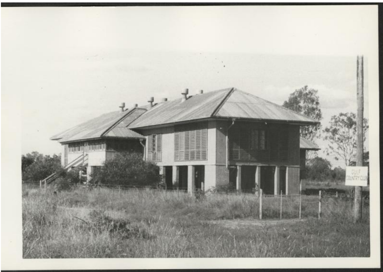
The Australian Crocodile Shooters' Club base in the Gulf of Carpentaria, 1952.

The Australian Crocodile Shooters' Club was founded in 1950 by a French-born, Melbourne-based ladies' hairdresser. Rene Henri was an enthusiastic big game hunter, as well as an entrepreneur who used the contrast between his two main business interests to good effect. The Club, and Henri's promotion of big game hunting within Australia, clearly sought to draw southern Australians north. In skilfully arranged press coverage of Club dinners in the southern cities and of crocodile hunting trips along the northern Queensland coast, Henri promoted the possibility of reaching the north comparatively quickly and enjoying the crocodile-based adventures it had to offer. This ability to travel into remote Australia using newly available air transport and road infrastructure marked a new epoch in northern tourism, which had begun in the late 1940s and which Henri sought to develop.