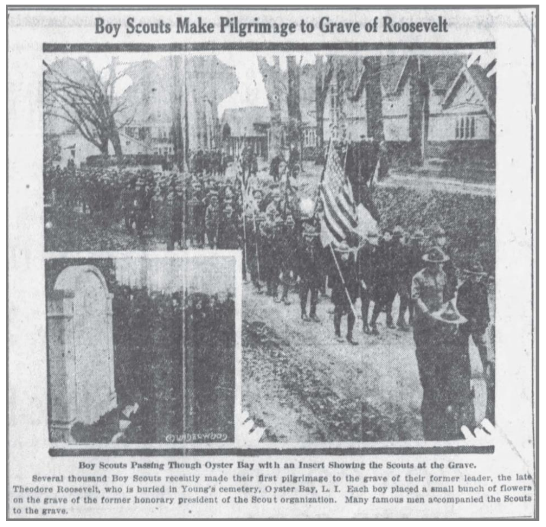
Fig. 3. Boy Scouts undertake patriotic pilgrimage to Theodore Roosevelt's grave to honor the BSA's Chief Scout Citizen