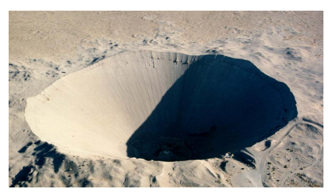
The Sedan Crater at the Nevada Test Site, n.d.

suggesting, "The banks of a nuclearly excavated canal would be natural angles of repose and therefore would be stable." The more nuclear tests the AEC conducted, however, the more slope stability seemed to be the bane of the technology. The 1962 Danny Boy Test reinforced this concern. Danny Boy's slopes were as steep as 45 degrees near the top of the crater and had resulted from only a 0.4 kt blast. The AEC suggested that 5 to 10 Mt devices were necessary to cut through the rocky continental divide of the Isthmus. There was a distinct potential that exponentially larger blasts might spawn exponentially steeper slopes as well.