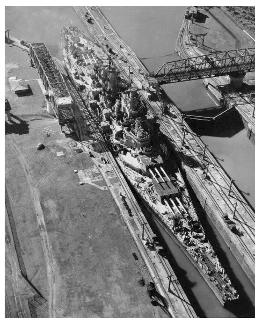
The USS Missouri making its way through the Miraflores locks, 13 October 1945.

Unknown photographer, courtesy of the U.S. Navy. Accessed on 12 March 2019. Click here to view Naval History and Heritage Command source.