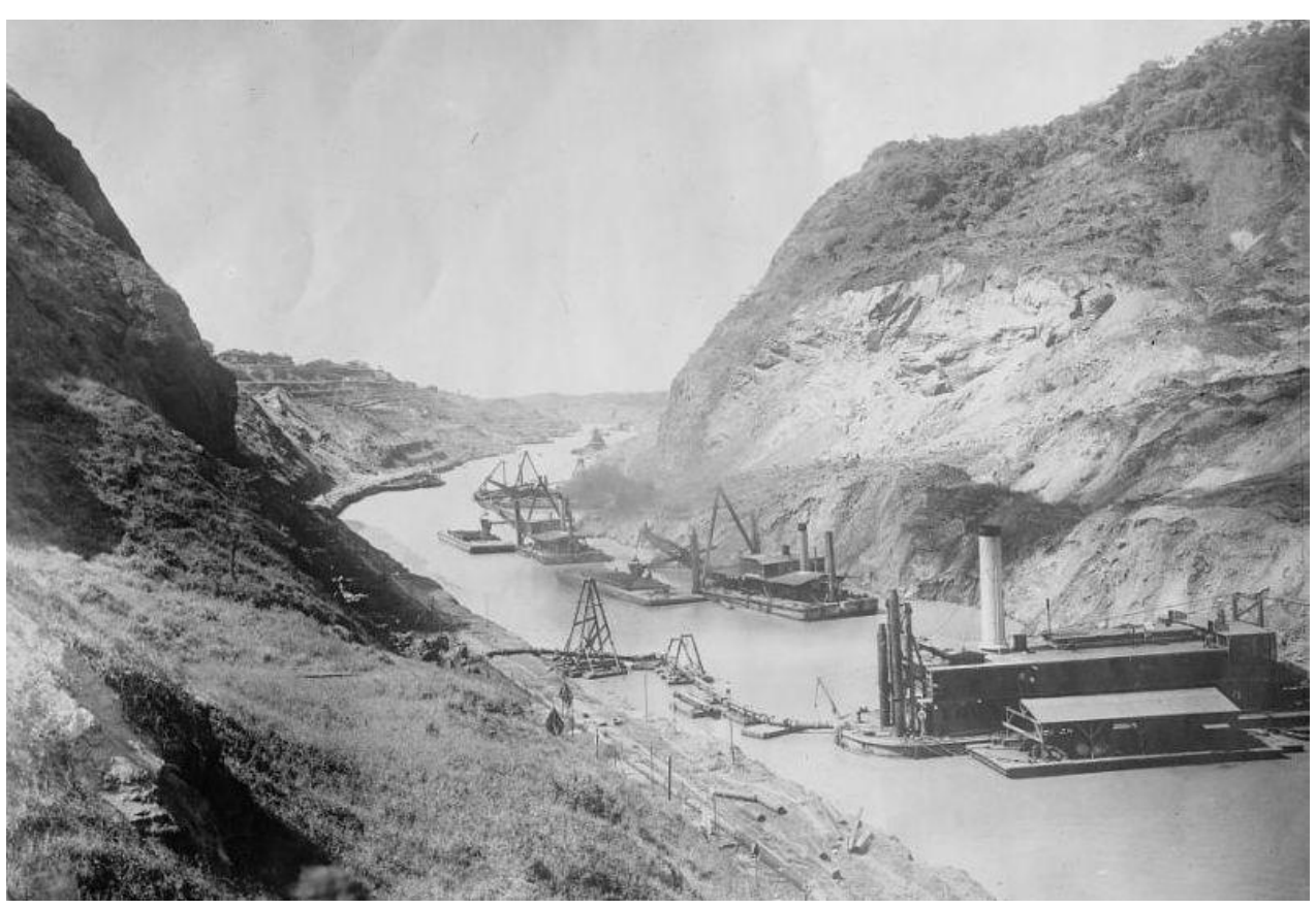
Photo of the dredges removing material from the Cucaracha slide in the Culebra Cut, ca. 1913.

Courtesy of Library of Congress, Prints & Photographs Division, LC-DIG-ggbain-17283. Accessed on 12 March 2019. Click here to view source