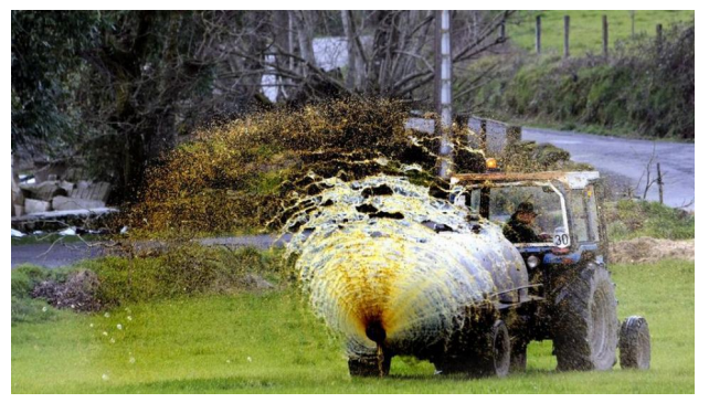
A slurry tank with a splash plate.

This work is licensed under a Creative Commons Attribution-ShareAlike 3.0 Unported License.