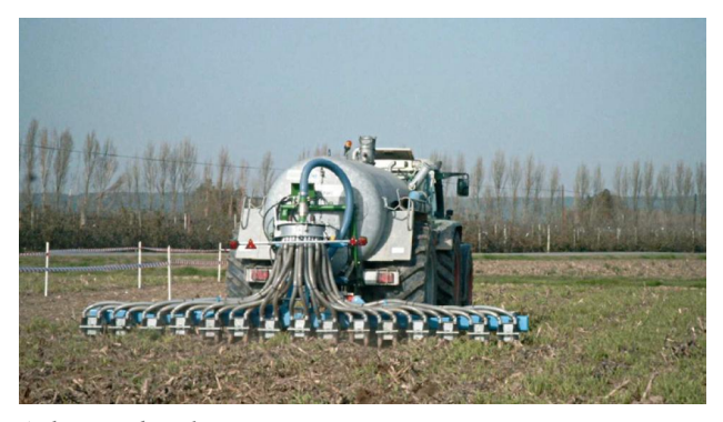
A slurry tank with an injection system.

However, since the end of the twentieth century, technological change has paid more attention to environmental sustainability criteria, as the European Union has proclaimed the need for alternative models of agricultural development. In May 2018, the Spanish government published another Royal Decree (RD 294/2017) that was meant to promote the Renewal Plan for Agricultural Machinery. Farmers had to introduce new injection systems or hanging tubes for the application of slurry in order to reduce ammonia emissions. Nevertheless, this policy was in striking conflict with the most popular application system in Galicia since the late 1960s: the slurry tank with splash plate.