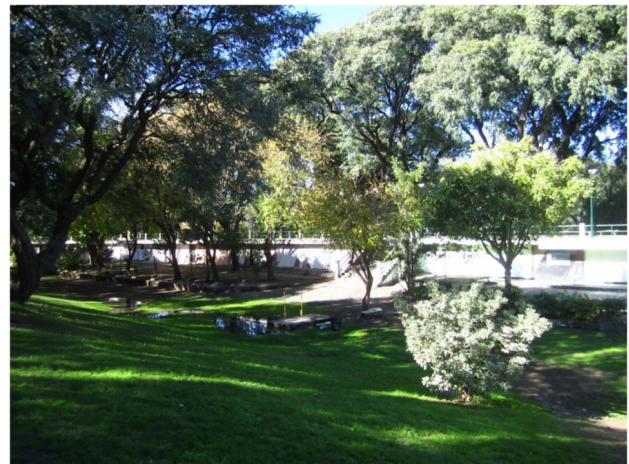
Present-day view of the breakwater from the same location, June 2014. The breakwater has been renovated and reopened to the public recently.

This work is used by permission of the copyright holder.