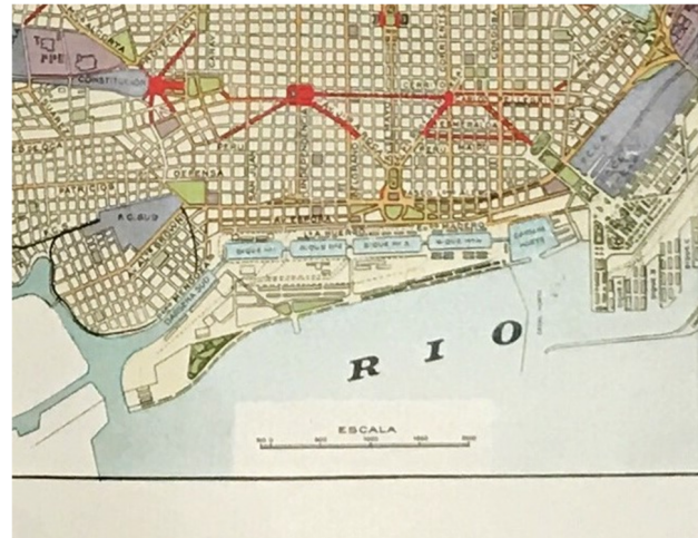
A close-up of the Costanera Sur from the master-plan map. Note the breakwater jutting out into the river and how the original avenue is situated immediately next to the river.

Image originally published in Comisión de Estética Edilicia. Proyecto orgánico para la urbanización del municipio, El plano regulador y de reforma de la Capital Federal . Buenos Aires: Talleres Peuser, 1925.