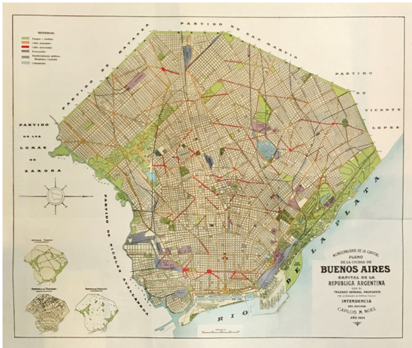
The 1925 master plan for Buenos Aires.

shallows starting in 1978 under the pretense of constructing a municipal administrative center, though the project never came to fruition.