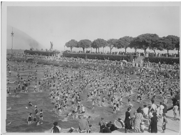
A view of the Balneario Municipal when it still functioned as a swimming area in January 1936.

Closer examination of the park raises questions, some of which have readily available answers while others do not. To the right of the entry path, a long concrete and marble structure stretches towards the river. Signs outside of the Reserva's entrance note that in the first half of the twentieth century, this was the site of the Balneario Municipal or the public swimming area. Opened to the public in 1918, this breakwater originally jugged out into the Río de la Plata, and steps leading down into the water gave Porteños—the name for citizens of Buenos Aires—a welcome respite from intense summer heat. Avenida Costanera Sur, which now goes by the name Avenida Dr. Tristán Achával Rodríguez, ran parallel to the water's edge and was lined with restaurants and cafes. Throughout much of the twentieth century, since the construction of this space in 1918, Porteños cherished that contact with the river and the social interaction the space provided.