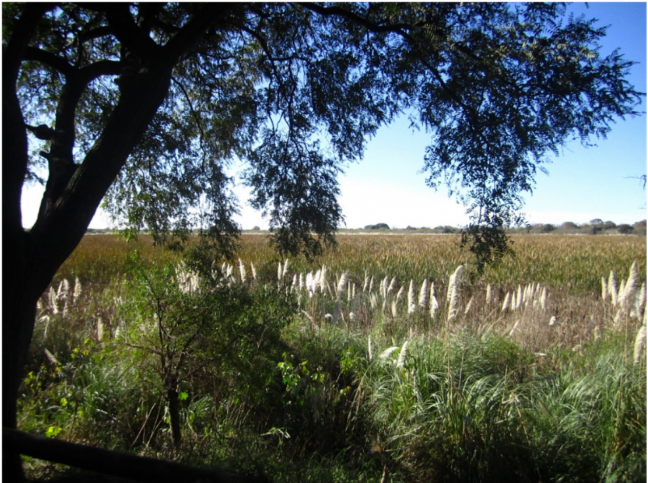
A view of the interior marshland of the Reserva Ecológica, June 2014.

What does it mean to reject or accept the histories attached to a landscape? Scholars and activists have worked diligently to build a damning history of Argentina's most recent military dictatorship, primarily through the collected memories of survivors. These accounts have created a lasting body of evidence attesting to the regime's depravity and recognizing the 30,000 lives lost in the fight against "subversion." However, the landscape of Buenos Aires contains other memories of this recent history that are not so readily recognized yet reveal a more complicated legacy of the military's push to transform the nation and its people.