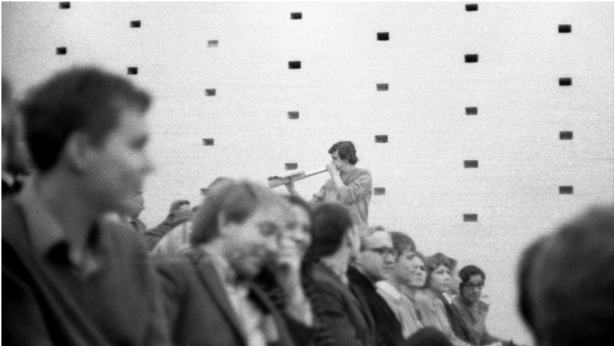
Activists scattering smoke among the audience to make them feel the pollution.