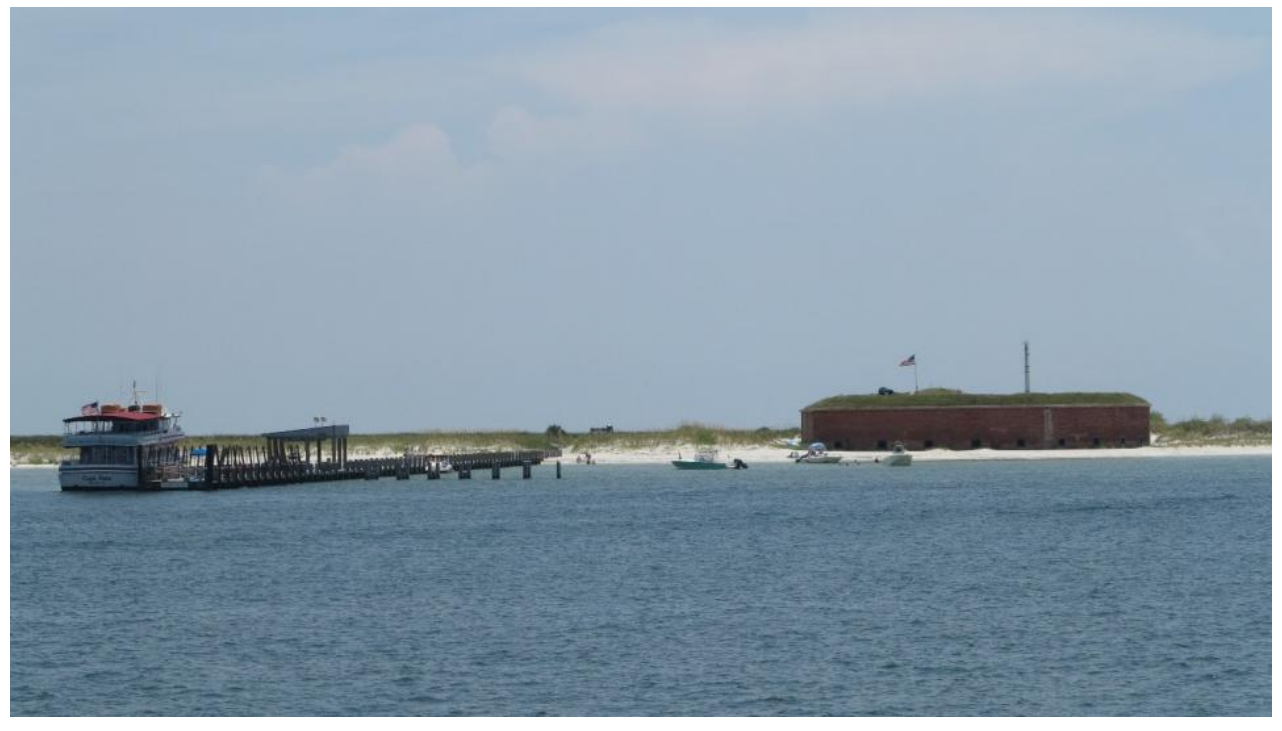
Ferry dock at East Ship Island, Mississippi, Gulf Islands National Seashore. The U.S. Army Corps of Engineers Mississippi Coastal Improvements Program is depositing sand to reconnect East and West Ship Islands, which were formed when Ship Island was breached by Hurricane Camille in 1969.