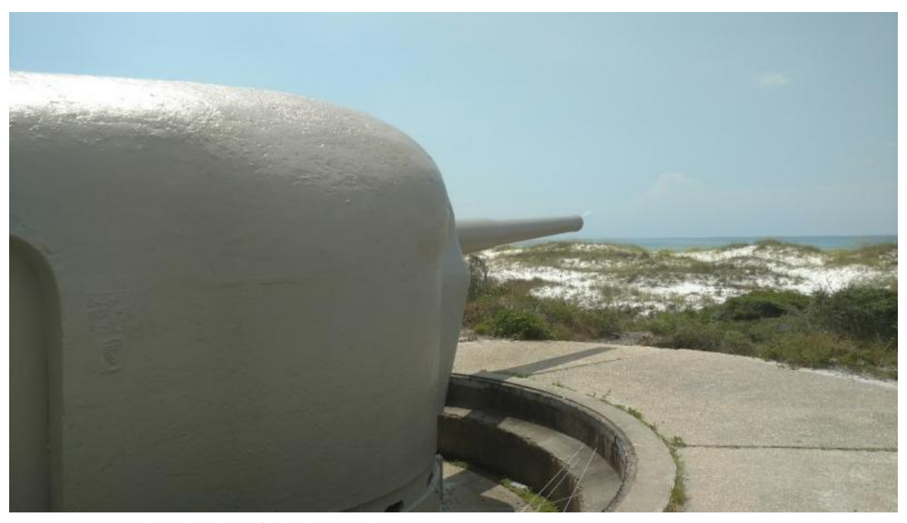
Battery 234, Fort Pickens, Florida, Gulf Islands National Seashore.

bulkhead to hold the island in place, defending Mississippi Sound by preserving the fort.