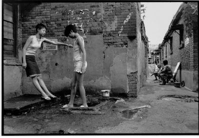
A shared water tap in the old-city area of Tianjin.