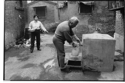
Residents using a shared running-water tap in the old city.

This work is used by permission of the copyright holder.