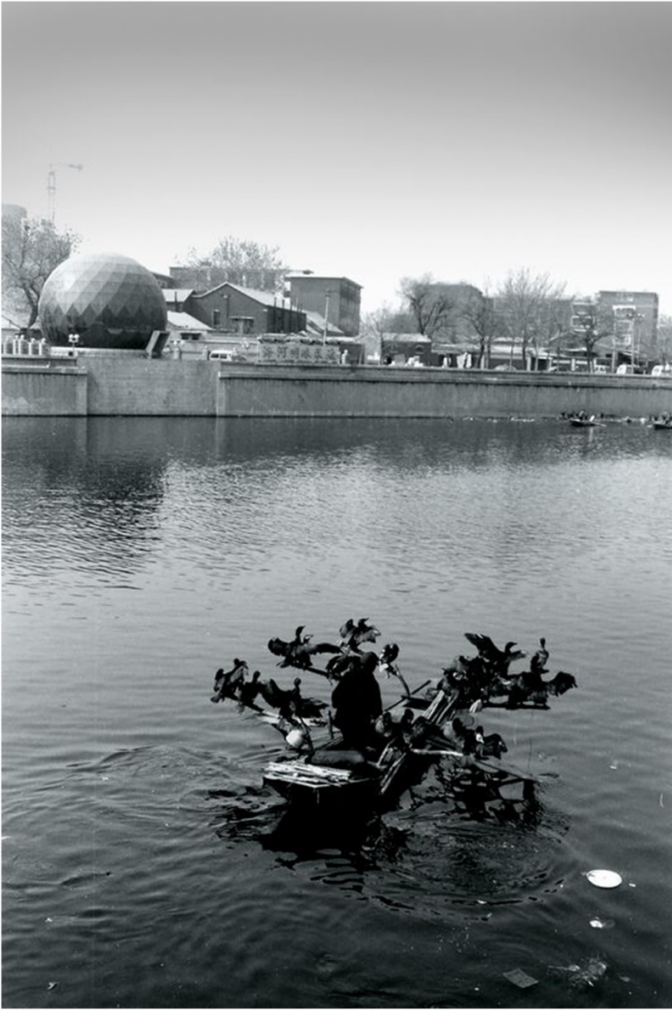
A fisher at Tianjin's three-river conjunction.