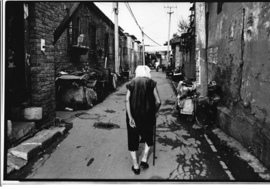
Fushu Street, Tianjin old city.

This work is used by permission of the copyright holder.