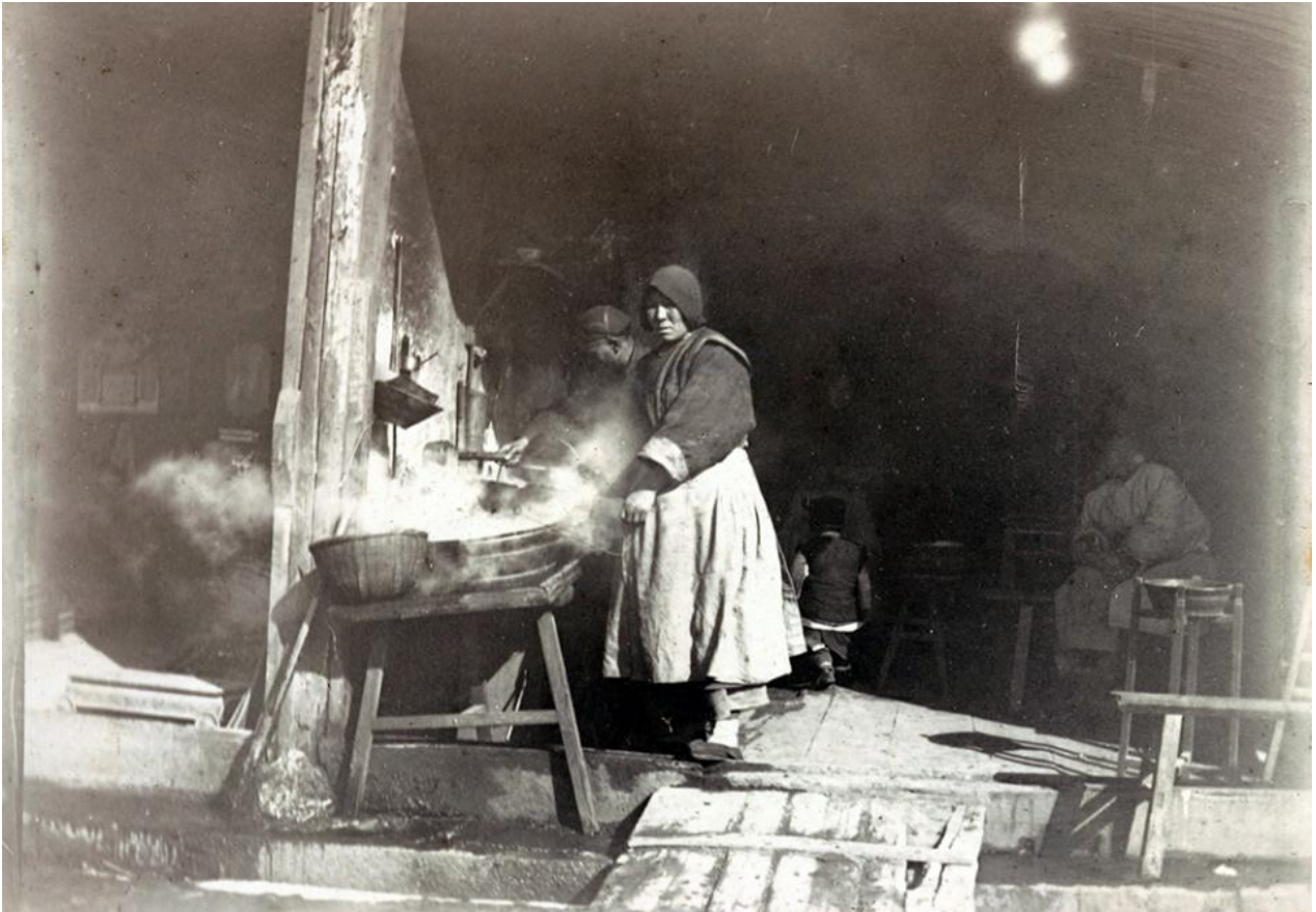
A Chinese hot water shop, c. 1902.

Photograph by Charles Ewart Darwent, c. 1902.