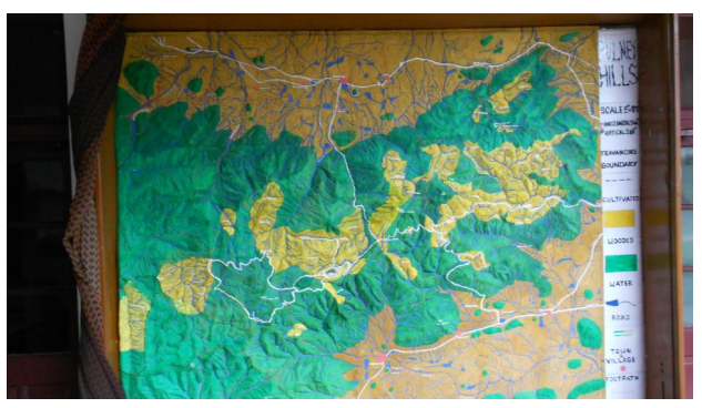
Palni Hills Review Map.

This work is used by permission of the copyright holder.