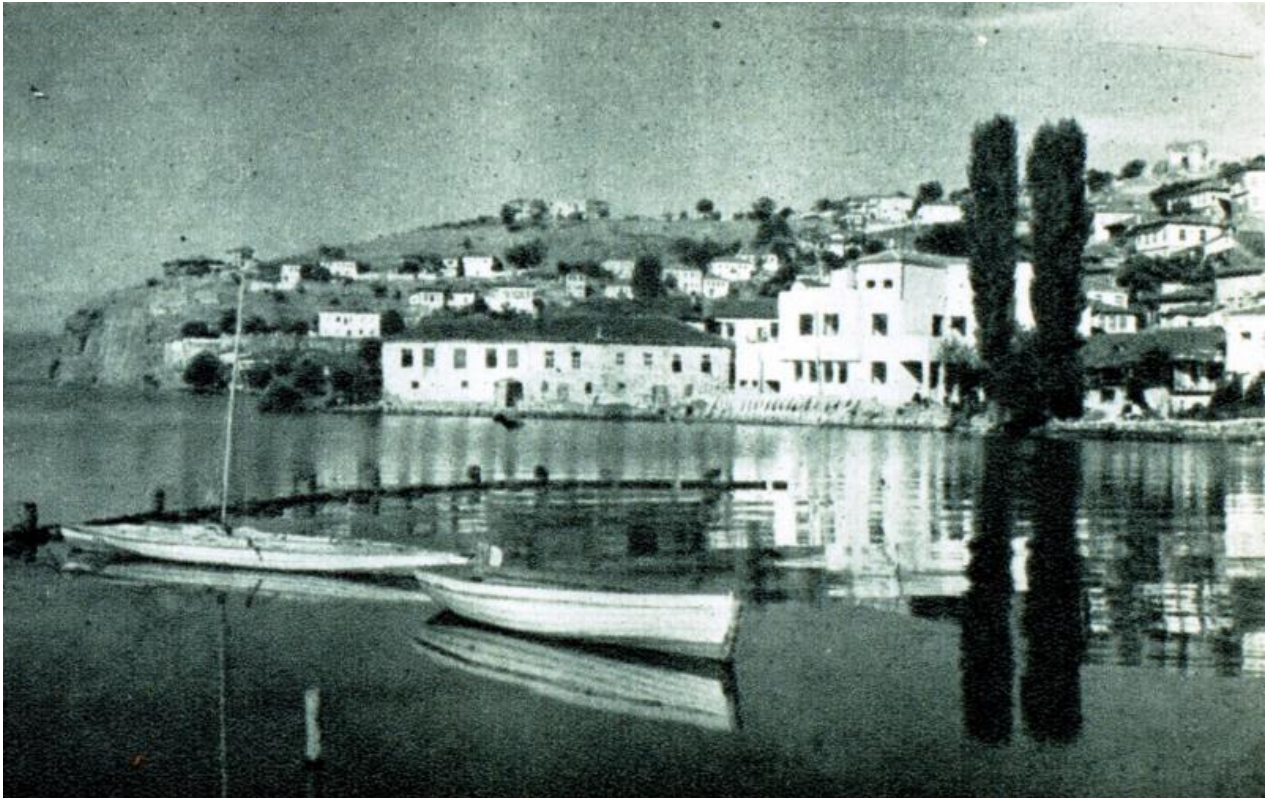
The old town of Ohrid before the building of the new tourist promenade.