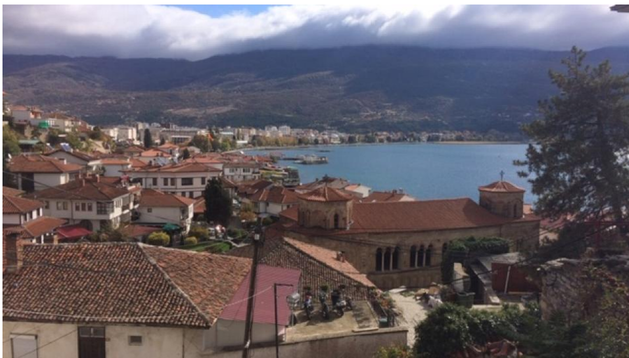
The old town of Ohrid on the northern shores of the lake.

Since economic development was part of a unified goal, tourism had to share Ohrid with agriculture and industry, the latter of which was especially prone to colliding with tourism. While one 1974 development plan for Ohrid considered tourism to be the most “suitable” for the region because of its natural “values,” it also called for further development of the chemical, textile, and metallurgical industries. With possible conflicts between industrial development, tourism, and preservation in mind, in 1972 the leadership initiated a spatial plan for Ohrid and nearby lake Prespa. The plan was meant to provide a physical framework that would simultaneously prevent conflicts, ensure economic growth, and preserve the region’s natural and cultural treasures.