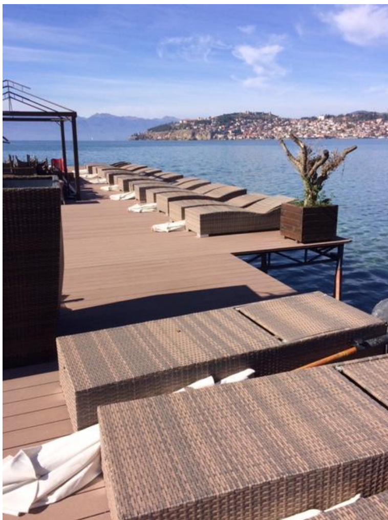
View of the town of Ohrid from a modern-day tourist beach.