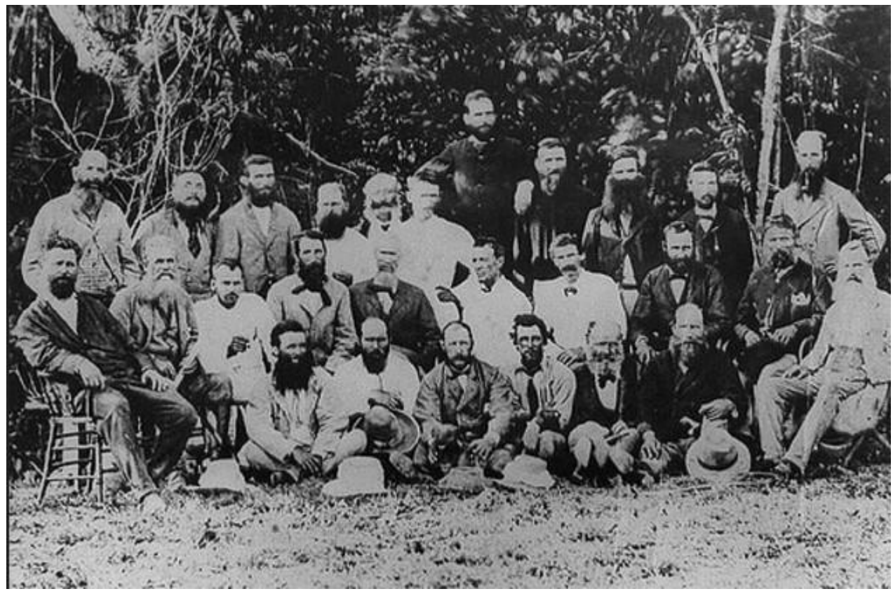
Samuel Griffith on an electioneering tour to the Herbert. Pictured with local landowners and businessmen, 1883. Griffith was Premier of Queensland from 1883 to 1888 and again from 1890 to 1893. When he became Premier in 1883 he replaced Premier Thomas McIllwraith. This was a blow to the planters because McIllwraith favored the importation of colored labor while Griffith opposed it.

attracted to the Herbert when government legislated for land ownership by a yeomanry class of white agriculturalists in order to stimulate agricultural production and to promote settlement for the defense of what was regarded as a tropical outpost. The small selectors farmed small crops and planted fruit trees. They kept pigs and fowls and both beef and dairy cattle. They supplemented their farm income with outside work such as fencing and building, timber getting, and pit sawing. By these means, they subsisted while supplying both the large sugar plantations and the wider community as it developed.