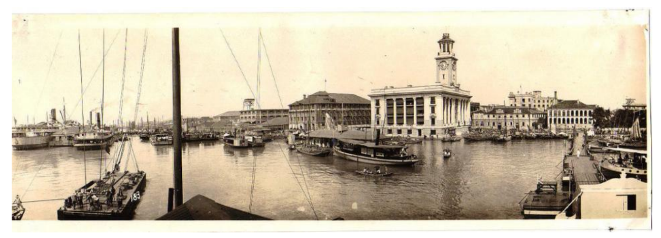
Hankow Floods in 1931.

nineteenth century. With the expanding population and rocketing demand for land, conflicts over land and water resources continuously broke out. As a result, collective dike management became more and more difficult—combined with wars and a lack of funds, the hydraulic systems of central China at the turn of the twentieth century were nearing the brink of collapse. After the Nationalist government settled into Nanjing in 1927, it put a top-down water-system reconstruction project at the top of its list of plans for economic and political revival. The main goal of the reconstruction was to unify the water system nationwide based on watersheds.