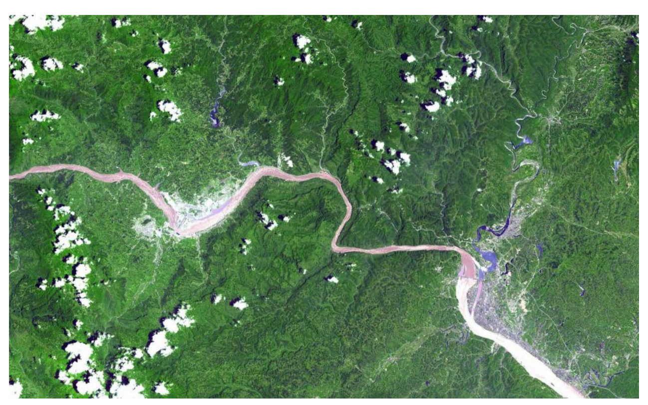
This ASTER image shows a 60 km stretch of the Yangzi river in China, including the Xiling Gorge, the most easterly of the three gorges. In the left part of the image is the construction site of the Three Gorges Dam, the world's largest dam.

Today the Chinese state has played a central role in megaproject constructions, damming the Yangzi and transferring water from Yangzi to the North and Northwest (South-North Water Transfer Project). The centralizing scheme of watershed management about a century ago was more than a historical phantom that built state power through ecological reorganization.