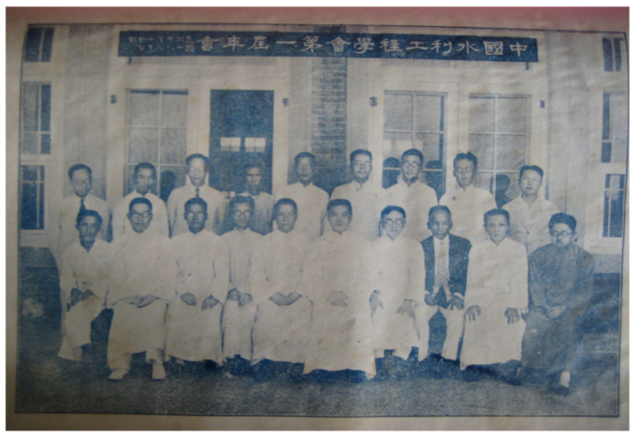
The first annual meeting of the Chinese Association of Hydraulic Engineering (1931).

Region, the Donggang Region (the lower Yangzi region), and the Zhujiang Region. He asserted that the rule of division should be based on a combination of hydraulic science, administrative convenience, and financial feasibility.