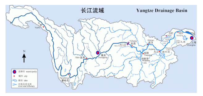
The Yangzi River basin.

The copyright holder reserves, or holds for their own use, all the rights provided by copyright law, such as distribution, performance, and creation of derivative works.