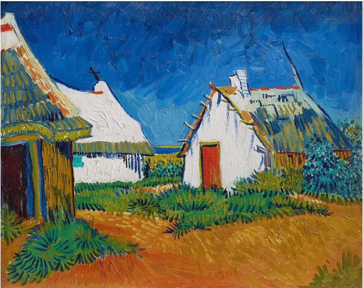
Vincent van Gogh, Cabanes blanches aux Saintes-Maries [Three white cottages in Saintes-Maries], 1888.