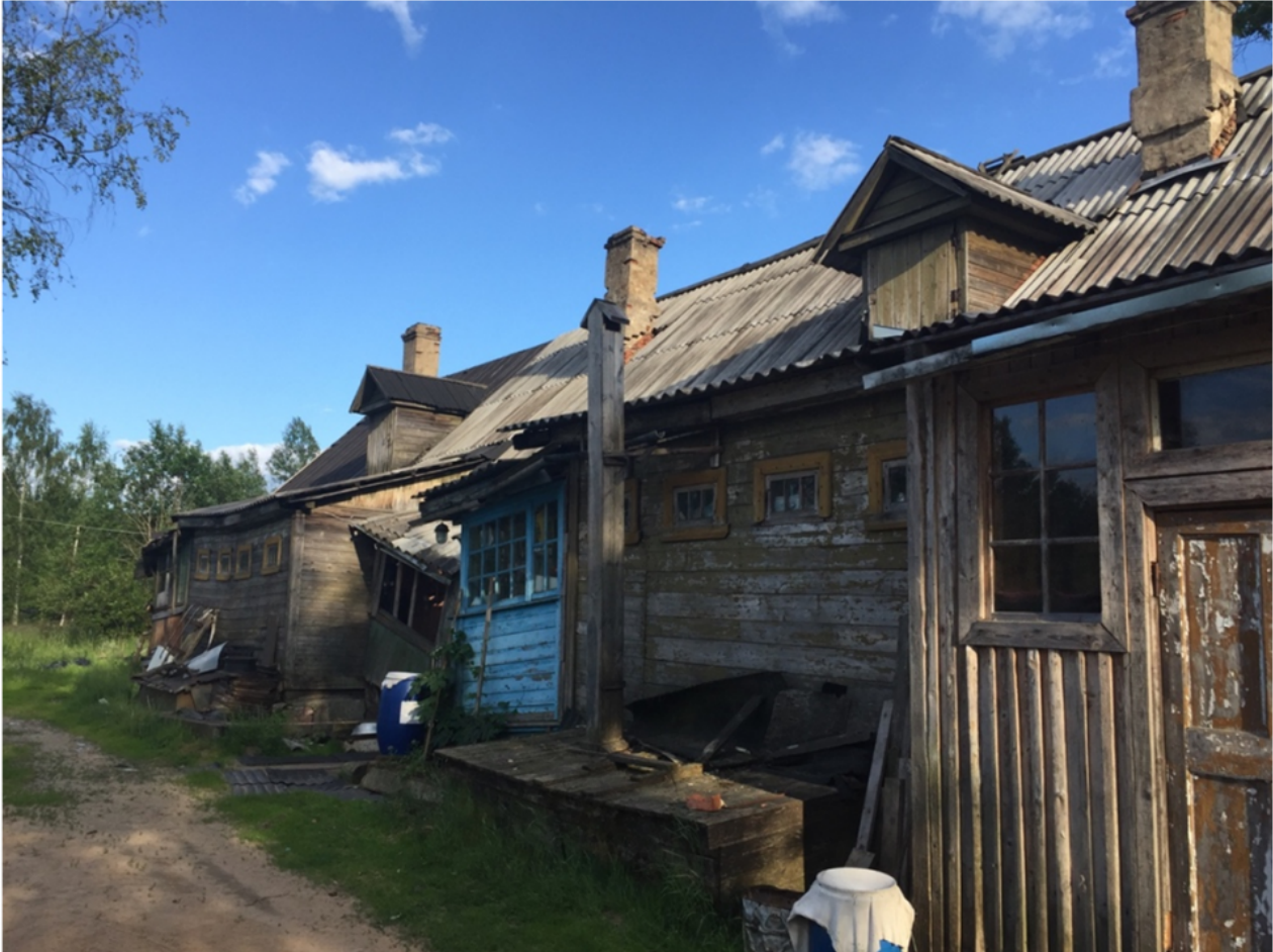
Figure 2. Houses in Workers' Settlement no. 13.

end in the late Soviet period. Surrounded by empty houses and abandoned garden plots, the former peat worker relies on a subsistence economy. I assume she gets some support from her neighbors who work for a security company in the city. For her, this is a landscape not of recovery, but of loss and decline (Figure 2).