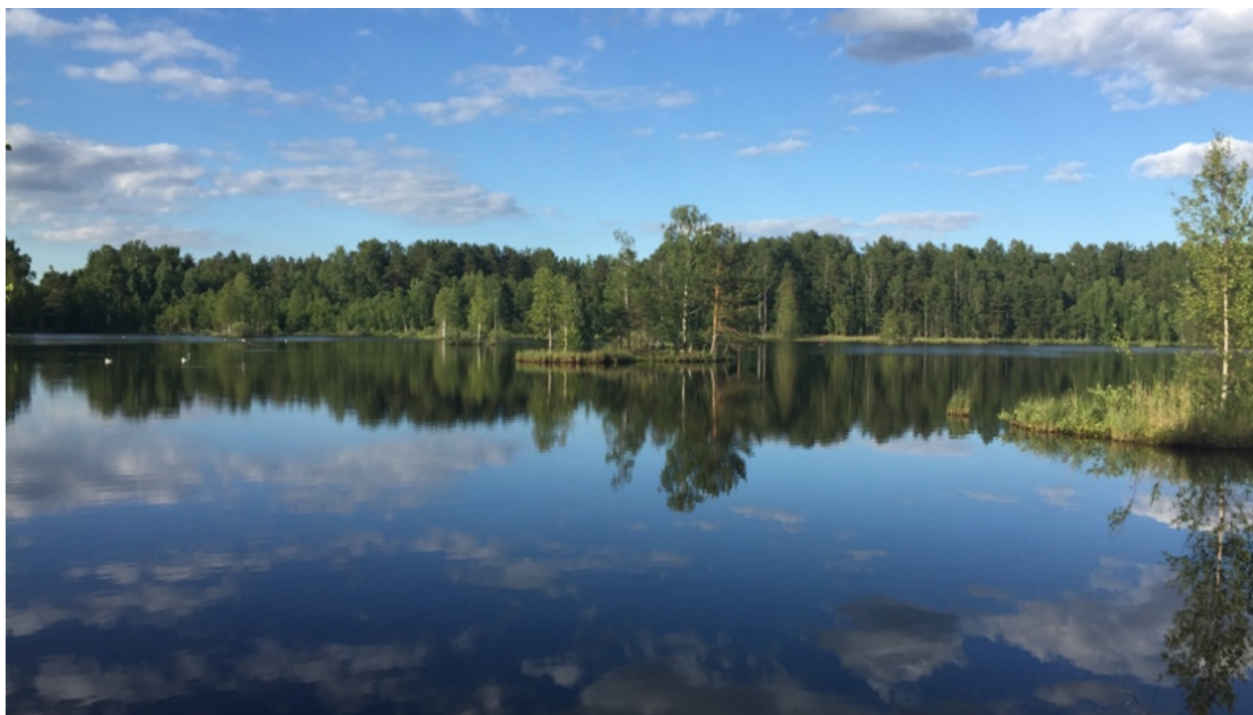
Figure 1. Abandoned peat pit of the former peat company Irinovka.