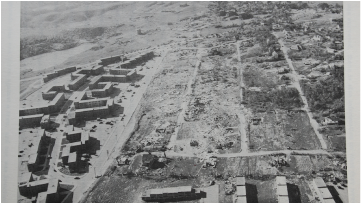
Photograph of Worcester in the aftermath of the tornado’s destruction.

Originally published National Academy of Sciences National Research Council Committee on Disaster Studies , 1956. US Government report.