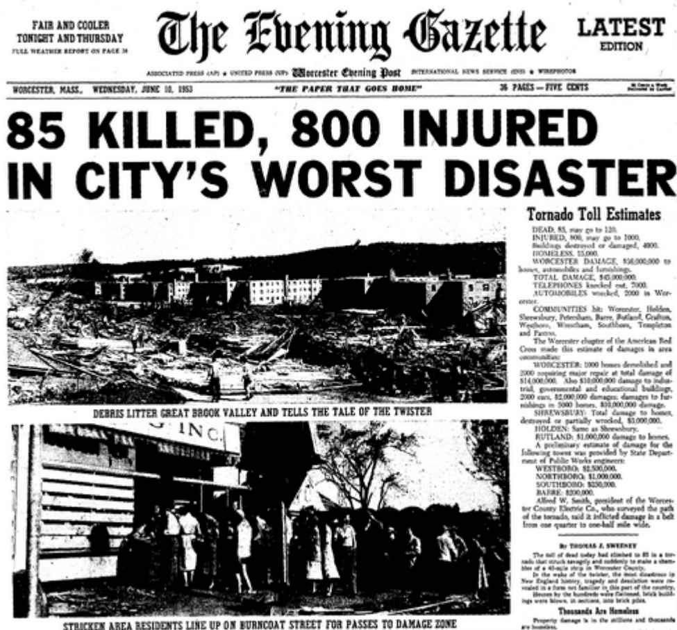
Front page of the Worcester Evening Gazette the day after the disaster.

Worcester Evening Gazette , 10 June 1953.