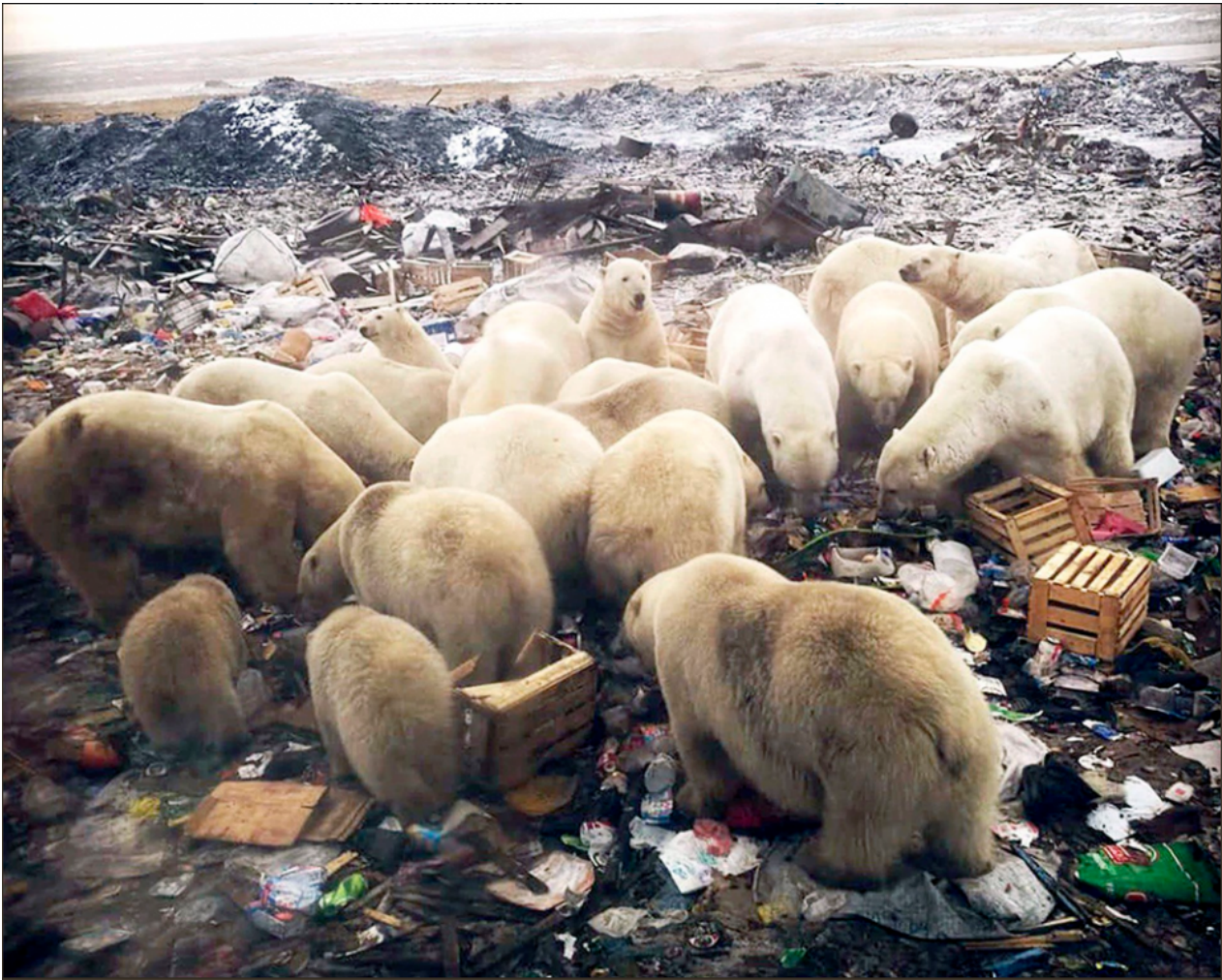
The group of polar bears at the local dump in Belushya Guba.

scaring them away. It was the largest polar bear group reaching a human settlement ever recorded in the region, and perhaps anywhere in the Arctic.