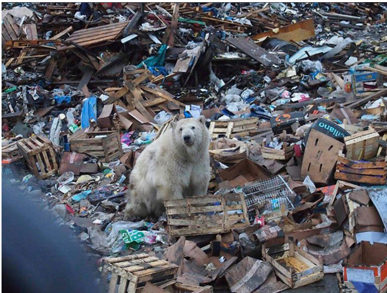
A polar bear at the local dump in Belushya Guba.