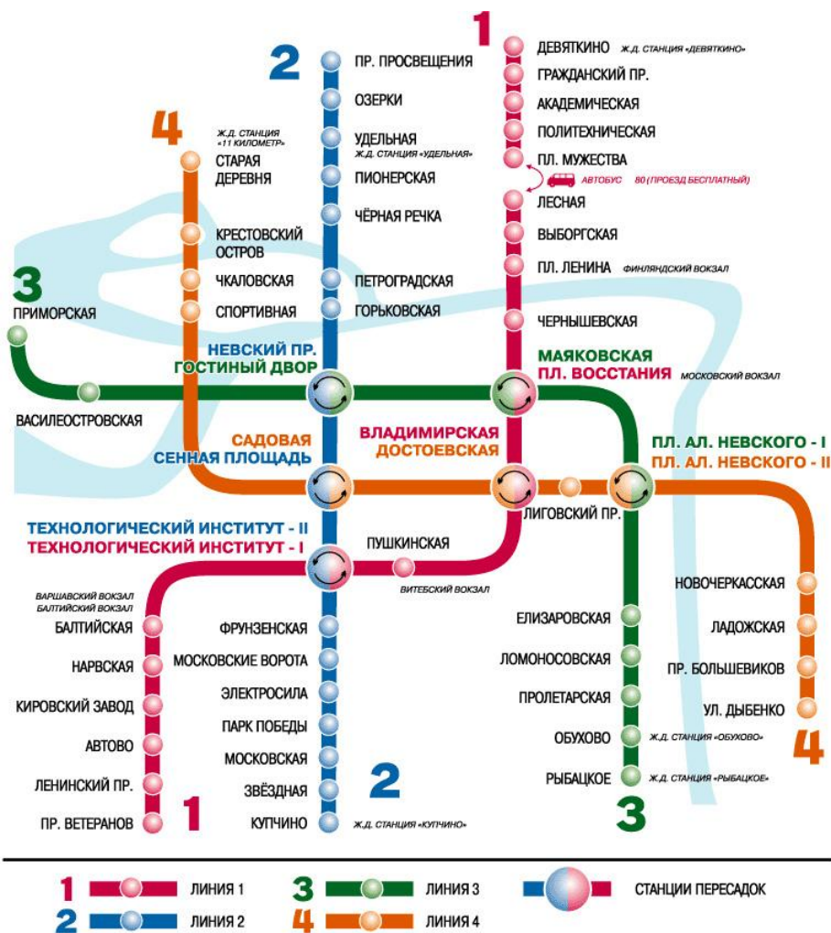
Official metro scheme from 2002, showing the “gap” between Lesnaya and Ploshchad Muzhestva stations.