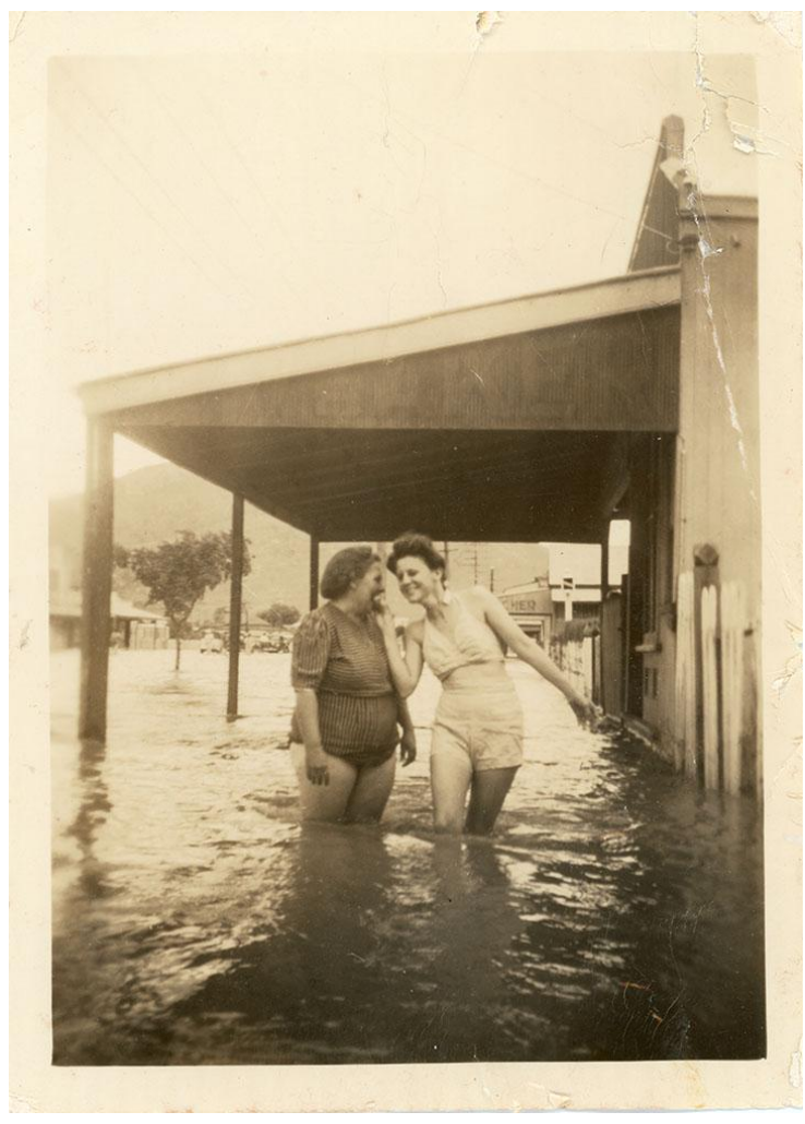
Townsville residents maintaining a sense of humor during a flood in 1946.

Established in 1864-65 on the Ross River plain, Townsville is located within Queensland's dry tropics, where drought is common. Since colonial settlement, local governments have battled to secure reliable supplies of water and councils have built expensive pipes to tap into the bounty of wetter climes to the north and to the southwest. Townsville has also endured around 20 major flooding events. The city's dry spells are often shattered by intense rainfall and, historically, flash and riverine flooding has disrupted society, damaged property and infrastructure, and caused the loss of human lives.