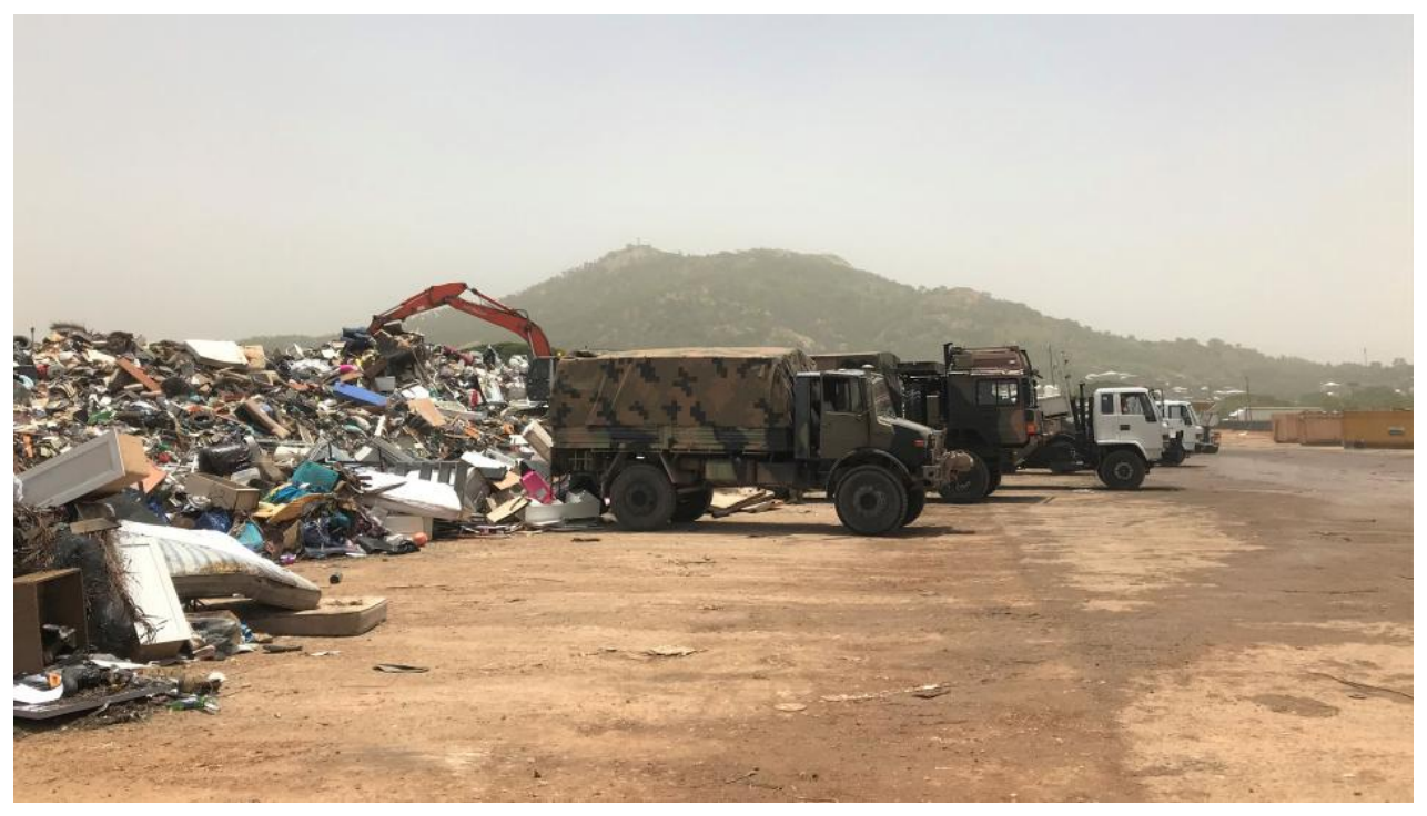
Photograph of army trucks clearing flood debris in Townsville, 2019. After the floodwaters had dried up, the Townsville City Council began clearing the mountains of flood debris with the assistance of the Australian Defence Force. This temporary dump site was located near the city center.

During the flooding of Townsville in January and February 2019, around two meters of rain fell within the Ross River catchment over fourteen days. The monumental deluge and subsequent catastrophic flooding gained international media attention after many homes were left uninhabitable and parts of the city became an urban archipelago. As the severity of the effects escalated, Townsville's community looked to the Queensland and Australian governments to manage the disaster and lead the recovery effort. In response, the Queensland state premier and the Australian federal prime minister visited the city to declare their support, and municipal authorities worked alongside emergency services, weather agencies, and the defense force to deliver critical information and to evacuate and shelter affected residents. Amid the chaos of flooding, there was a familiar sense of civic relief as the rain replenished the city's water supply. These concerns—abundance and scarcity—run through Townsville's water history.