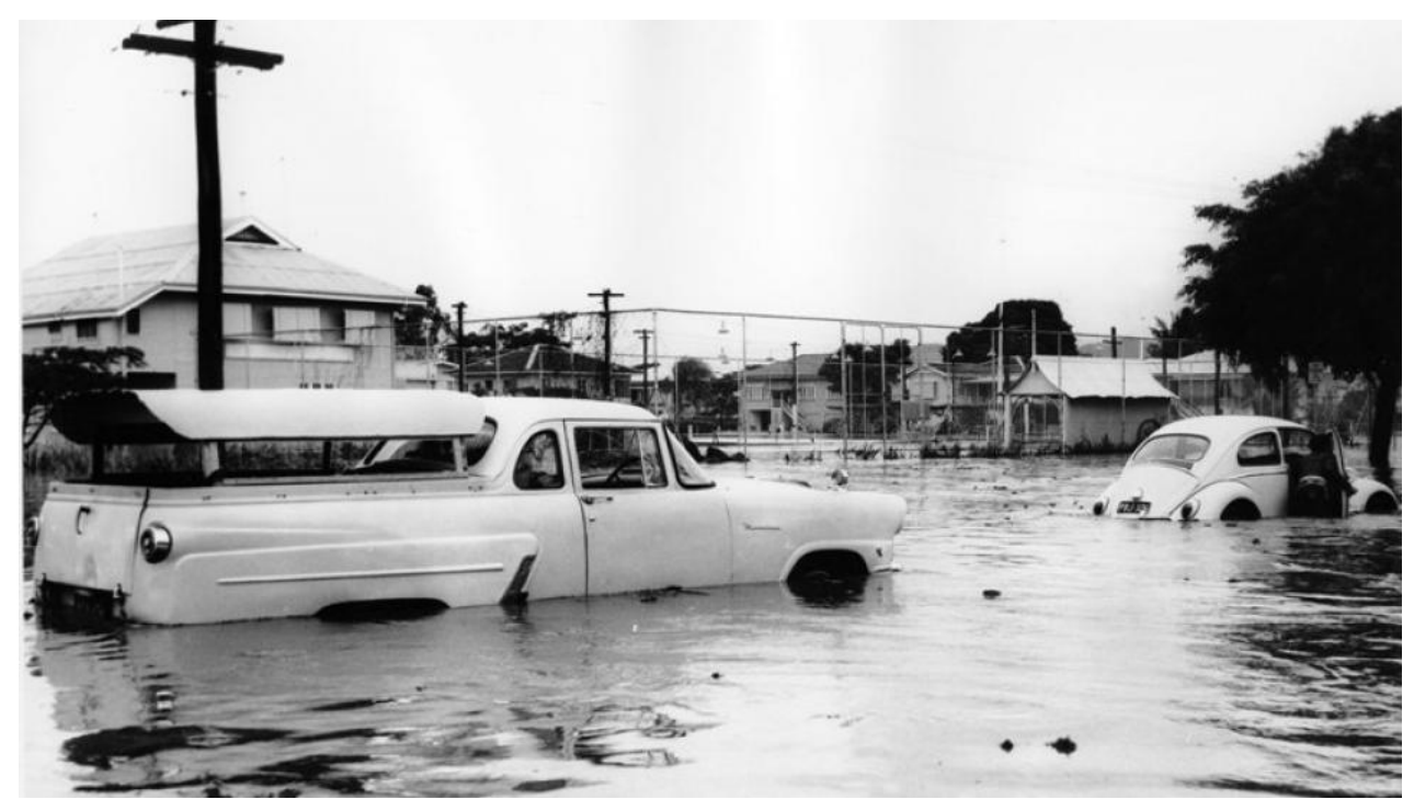
Townsville's Hermit Park endures yet another flood, 30 January 1965.

The NQLGA led a regional post-war reconstruction agenda that stimulated further development, and by the 1950s, flooding was an accepted part of life in Townsville because of the revitalizing effects of heavy rain. Rather than restrict development, flooding restored hope and extinguished the doubts about future prosperity that surfaced during droughts.