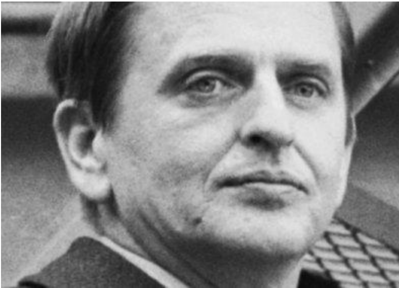
Sweden's Prime Minister Olof Palme (early 1970s)