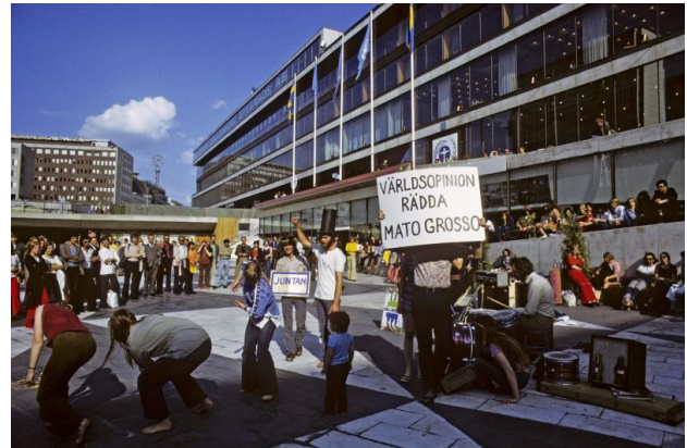
An environmentalist group demonstrates outside the New Parliament building during one of the conference sessions.

The copyright holder reserves, or holds for their own use, all the rights provided by copyright law, such as distribution, performance, and creation of derivative works.