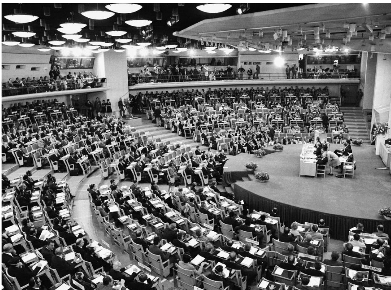
A general view of the opening meeting of the UN Conference at the Folkets Hus in Stockholm