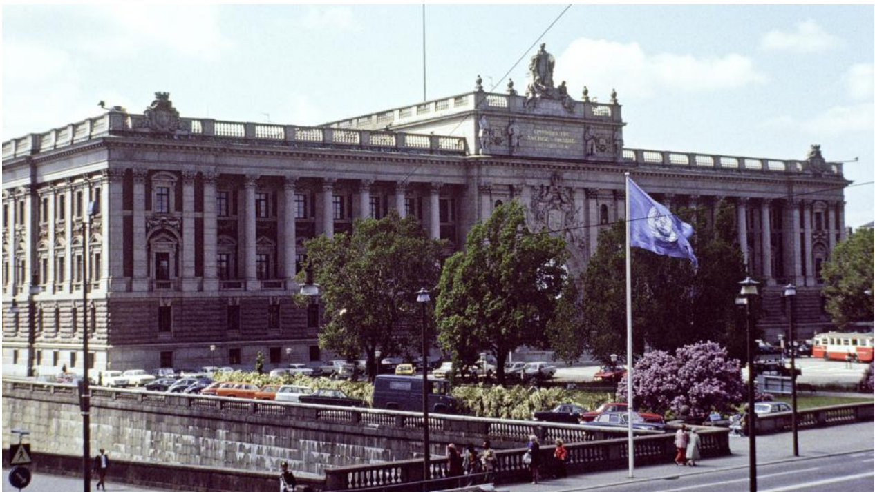
A view of the New Parliament building in Stockholm where some of the conference meetings were being held

Large-scale industrial pollution, the growing threat of nuclear radiation, documented mass destruction of entire ecosystems around the globe: the 1960s witnessed the advent of widespread international concern about a global environmental crisis. As this heightened global awareness triggered a modern environmental movement, it was the initiative of a small country in Scandinavia that laid the foundation for international cooperation on environmental matters.