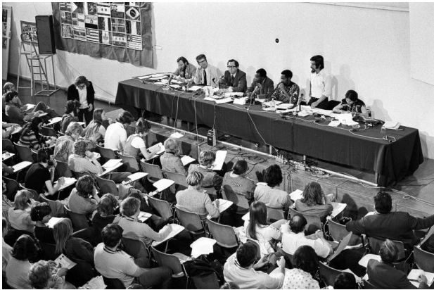
An environment forum took place at the National School of Art in Stockholm on 7 June.