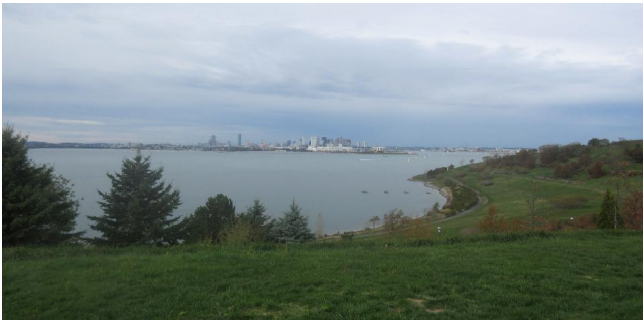
The Boston skyline seen from Spectacle Island, 2016.

The Boston Harbor Islands are “minutes away, worlds apart” from Boston, according to the motto of the National Recreation Area that includes all 34 of them. They do look like another world when regarded from Boston’s waterfront: tranquil green elevations rising gently above the waters of Boston’s oceanic threshold, several kilometers from the city’s shores. The reverse is also true: standing on Spectacle Island, one of the larger islands closest to the city, the Boston skyline in the distance seems like the shore of a strange continent. The water expanse between the island and the mainland seems to mark a boundary between two completely independent environments. The national park, established in 1996, seems to have solidified this division: the parched concrete of the city on one side and the pristine nature of the harbor islands on the other.