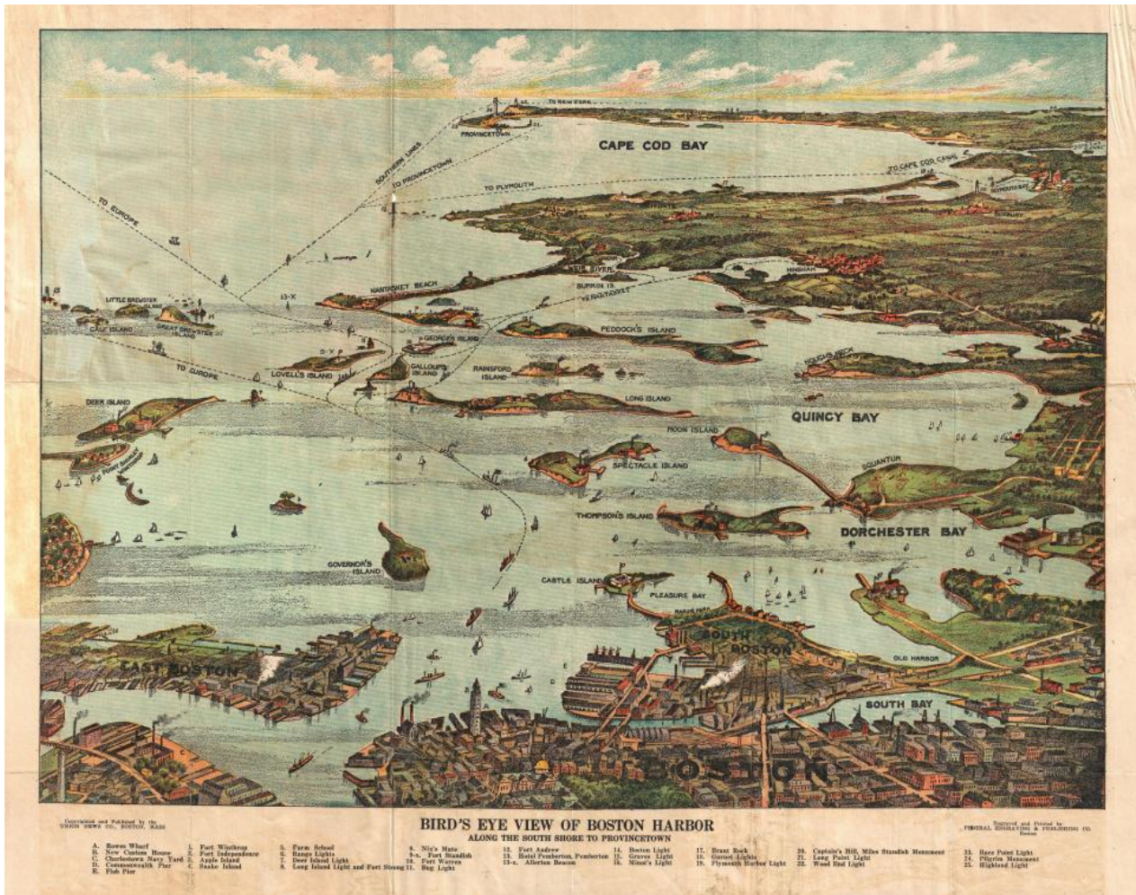
An 1899 bird's-eye view of Boston Harbor. Notice the smokestacks suggesting the industrial uses of many of the harbor islands.