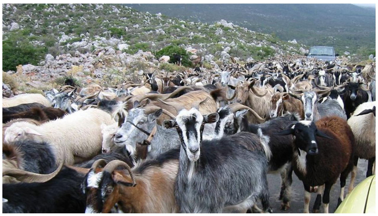
A herd of goats in the Greek highlands.

Grazing is an old practice in the countries of Southern Europe, where livestock farming was the main human activity, supporting the economies and the societies, and shaping the ecosystems and landscapes of the Mediterranean. In discussing the factors underlying deforestation in the Mediterranean, goat grazing is considered the main factor. In the past, it was widely believed that goats per se were the real culprit, and not the continuous, uncontrolled overgrazing for which humans are responsible. All domestic animals, if they are not managed properly, can damage forests through overgrazing. The Greek state, from the early years of its liberation from the Ottoman Empire, took decisive measures to tackle the problem of overgrazing, especially by reducing the numbers of goats or even eliminating them completely.