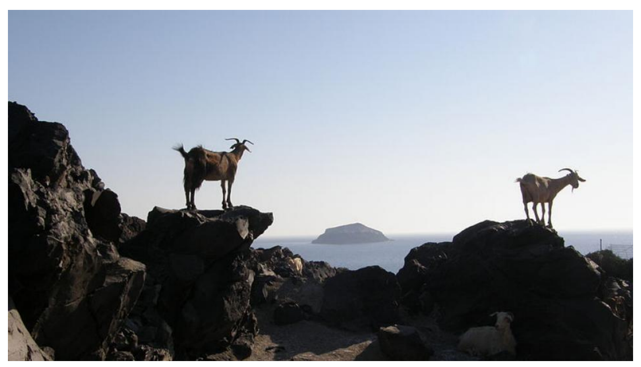
Goats on the island of Palea Kameni, Santorini. Photograph by Yarl, 2008. Accessed via Wikimedia. Click here to view source.

This work is licensed under a Creative Commons Attribution 2.0 Generic License.