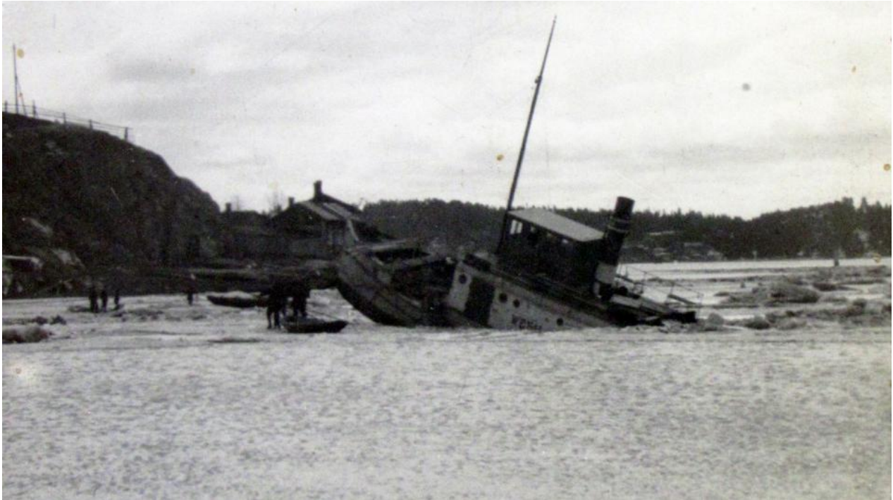
In the breakup in 1903, the ice-jam flood swept Wehmaa all the way to the mouth of the Aura River.

city was sound asleep, which is why there were no casualties. For the citizens who depended on the ferry to get across the river, its absence probably generated some nuisance in the morning on 24 March. Besides the minor damages caused to private households, and the destroyed moorings and quays that were maintained by the city, most of the costs fell on the ship owners.