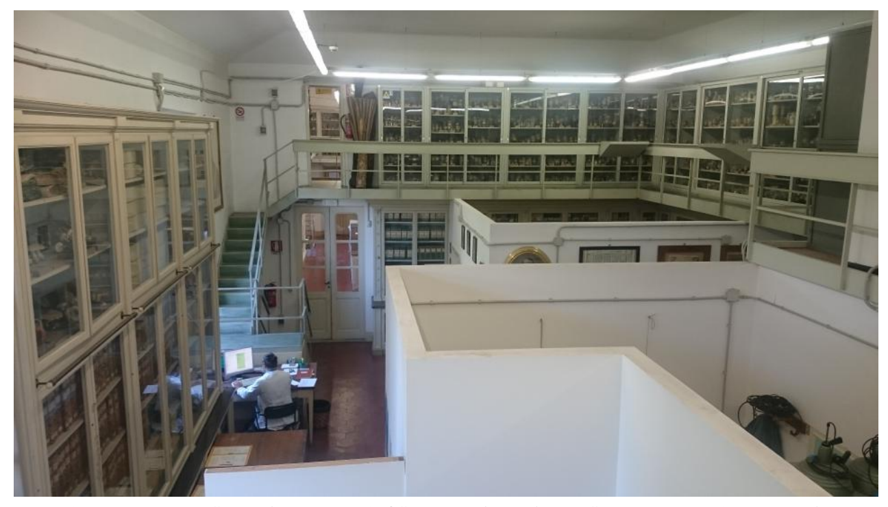
Figure 4. The "carpotheque" collections (continuing in the following room) housed in 33 gallery cabinets above the comings and goings in the new office spaces. Some of the palms that were displayed in the center of the Galleria dei Prodotti Vegetali are visible by the door.

including evolution and conservation. In contrast to Parlatore's ambition towards universality or completion, this guide to the downsized museum apologetically claims that it cannot cover all aspects of botany. Instead, it offers a set of perspectives through which the visitor can explore the collections—an approach that is nonlinear and multilayered.