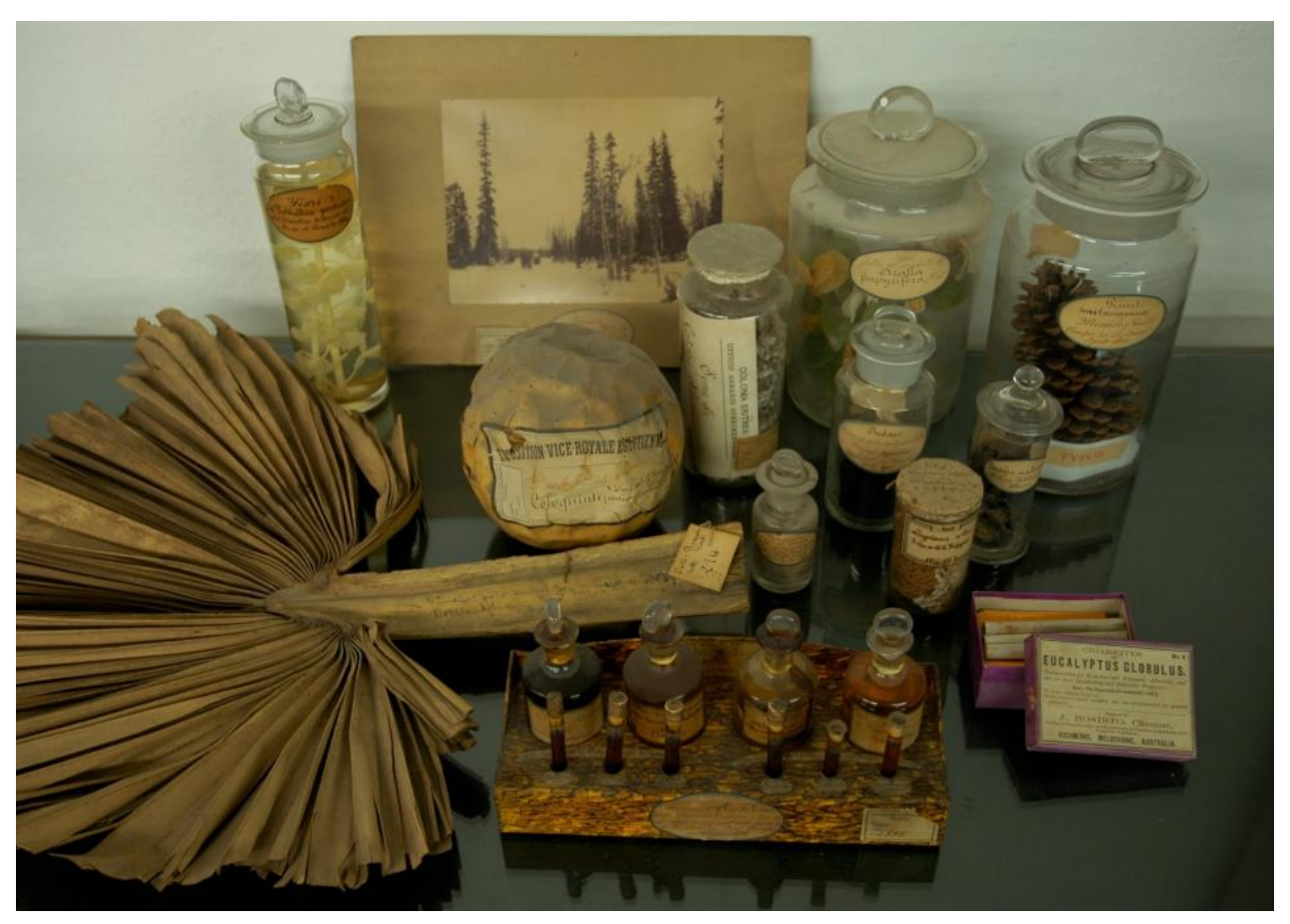
Figure 5. A selection demonstrating the diversity of the "carpotheque" collection, much of which was originally displayed in the "prodotti vegetali" exhibition: a palm leaf collected by Odoardo Beccari; the flower of Tozzettia persica (in spirits) grown in the botanical garden in 1854; the photograph of a wintry forest landscape in the far north of Finland ("Torneo" and "Kittila"); a dried "coloquinte" (desert gourd) from the "Exposition Vice-Royale Egyptienne"; cotton seeds from Italy's colony of Eritrea (1903); paper flowers made of Aralia papyrifera ; a pinecone from the type Pinus soulangeana bought in London, 1862; Strychnos nux-vomica obtained in an exchange with the Museo Tecnologico, Florence, 1878; indigo "di una pianta indigena della Confed. Argentina" donated by Sig. Durrassi in February 1868; Trapa natans from the "antica collezione dei museo"; fiber and fabric from Lupinus albus ; Eucalyptus globulus cigarettes from a chemist in Melbourne; and a selection of beautifully presented local Tuscan flax oil.