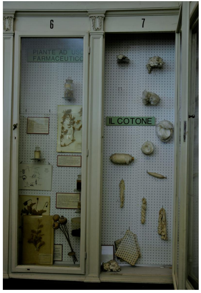
Figure 3. The pharmaceutical cabinet brings together "prodotti vegetali" and herbarium specimens for several important drugs, including cannabis, marijuana, and opium. The cotton cabinet depicts the process of production from plant to commodity, from the cotton pods to woven fabric, following the same progression as the linen display in cabinet 8.