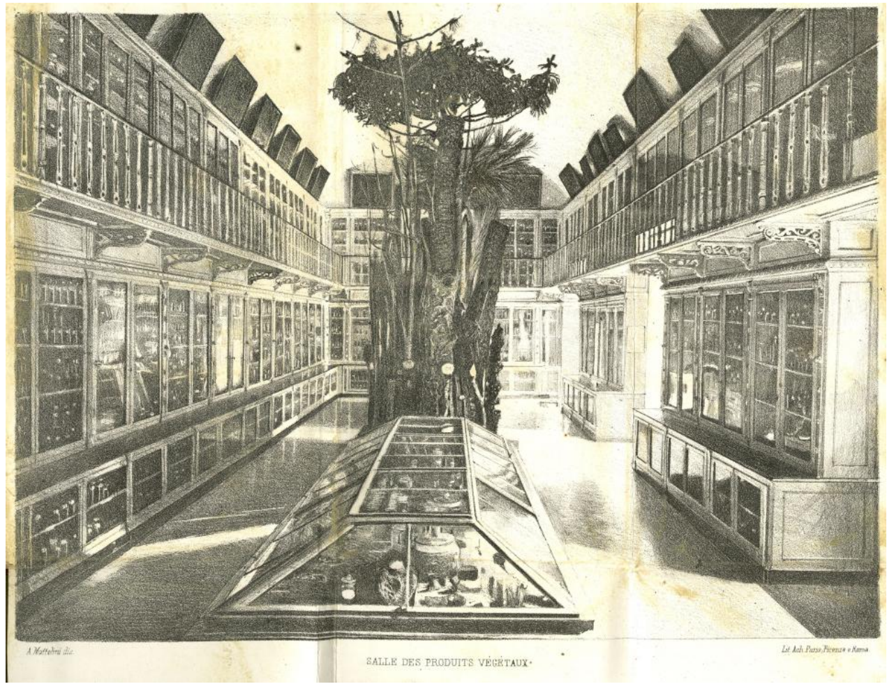
Figure 1. A print of the gallery of vegetable products from Filippo Parlatore's 1874 catalogue Les Collections Botaniques du Musée Royal de Physique et d'Histoire Naturelle de Florence .

Philippe Parlatore, Les Collections Botaniques du Musée Royal de Physique et d'Histoire Naturelle de Florence au Printemps de MDCCCLXXIV, (Florence, 1874; anastatic reprint, 1992).