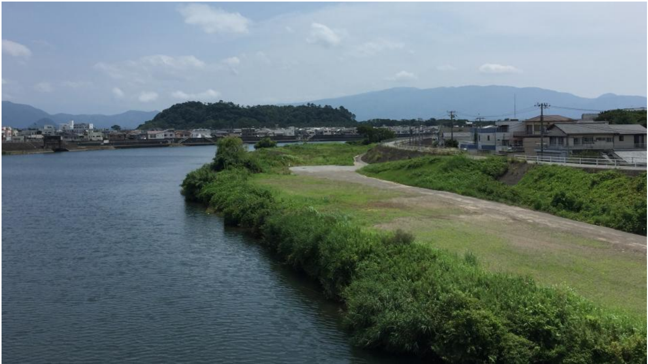
Ushibushiyama, Numazu City.

actions treat the earthquake as an omen of future danger to the court and the crown, and sources mention the specific prognostication of future rebellion as the prime worry. It was only on the fifteenth day after the earthquake, when the court had already begun deliberations on further symbolic repentance, that members of the court first record hearing of the tsunami. Although not as well recorded as the religious responses, upon receiving this news the state decided to forgive taxation in the afflicted areas, a practical as well as symbolic performance of benevolence and virtue, and one designed to encourage local communities to rebuild.