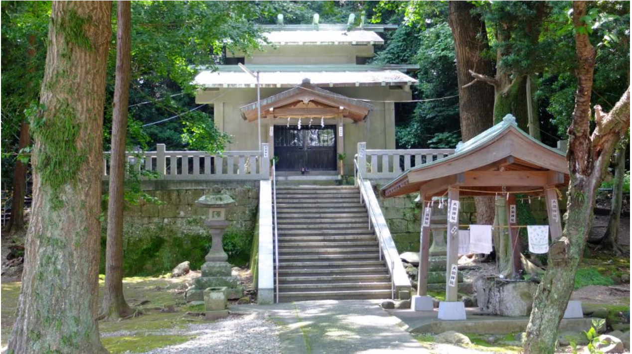
Ōasa Shrine, 2016.