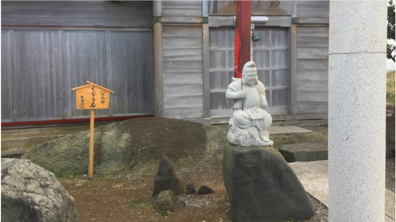
Whale Stone at the Nishinomiya Shrine near Ebisu Bay, Hachinohe. According to legend, the large stone in the background was once a whale god killed by western Japanese whalers. A statue of the god Ebisu is placed in front.