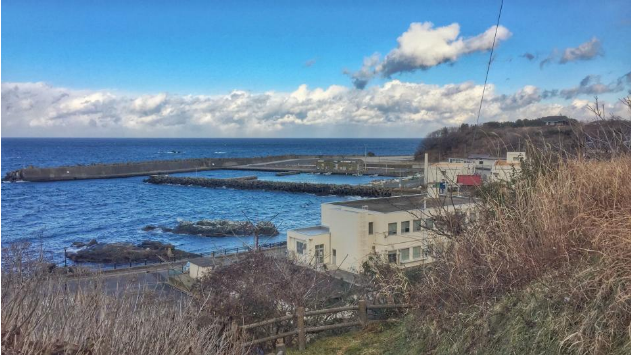
View over Ebisu Beach, where the first whaling station was built in 1911.