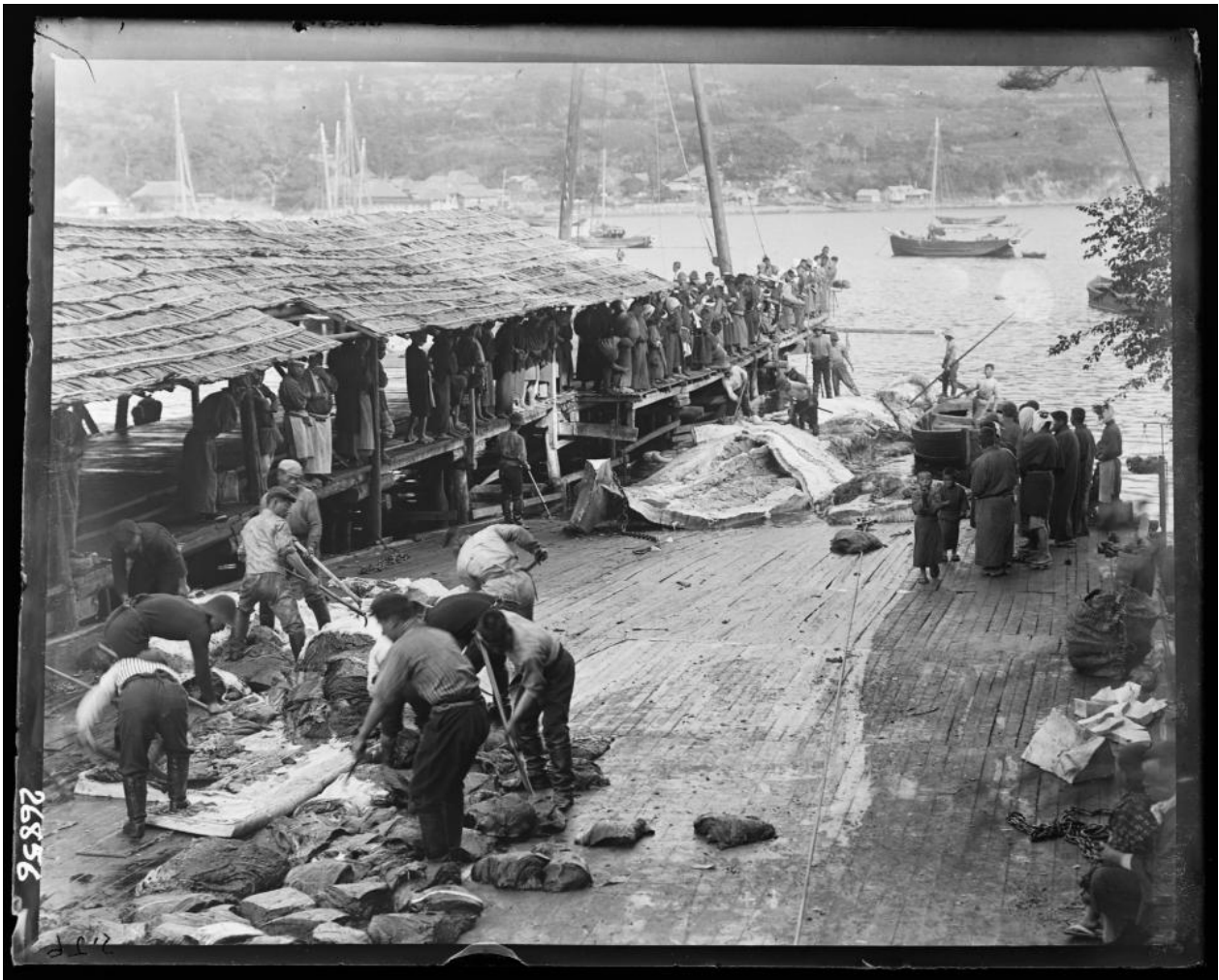
Typical scene of a whale flensing at a Japanese whaling station in 1910 (Ayukawa, Miyagi Prefecture).

On 4 January 2019, only a few weeks after the Japanese government unexpectedly announced that the country would withdraw from the International Whaling Commission (IWC) and restart commercial whaling after a 31-year hiatus, the mayor of the port city Hachinohe expressed hopes that his city could become the nucleus for future Japanese whaling. He explained that “From old, Hachinohe city has had a whale culture.” Indeed, whales have played an essential role in the cultural and economic history of the region for centuries; however, Hachinohe’s relationship with whales is much more ambiguous than the words of the mayor suggest. A little more than one hundred years ago, on 1 November 1911, the largest anti-whaling riots in Japanese history struck the region, leading to the destruction of the local whaling station and the death of two rioters. As I argue in this essay, Hachinohe’s complicated relationship with whaling, while not acknowledged officially, still plays an underlying role in the city’s current push to reinvent itself as one of the leading Japanese whaling towns.